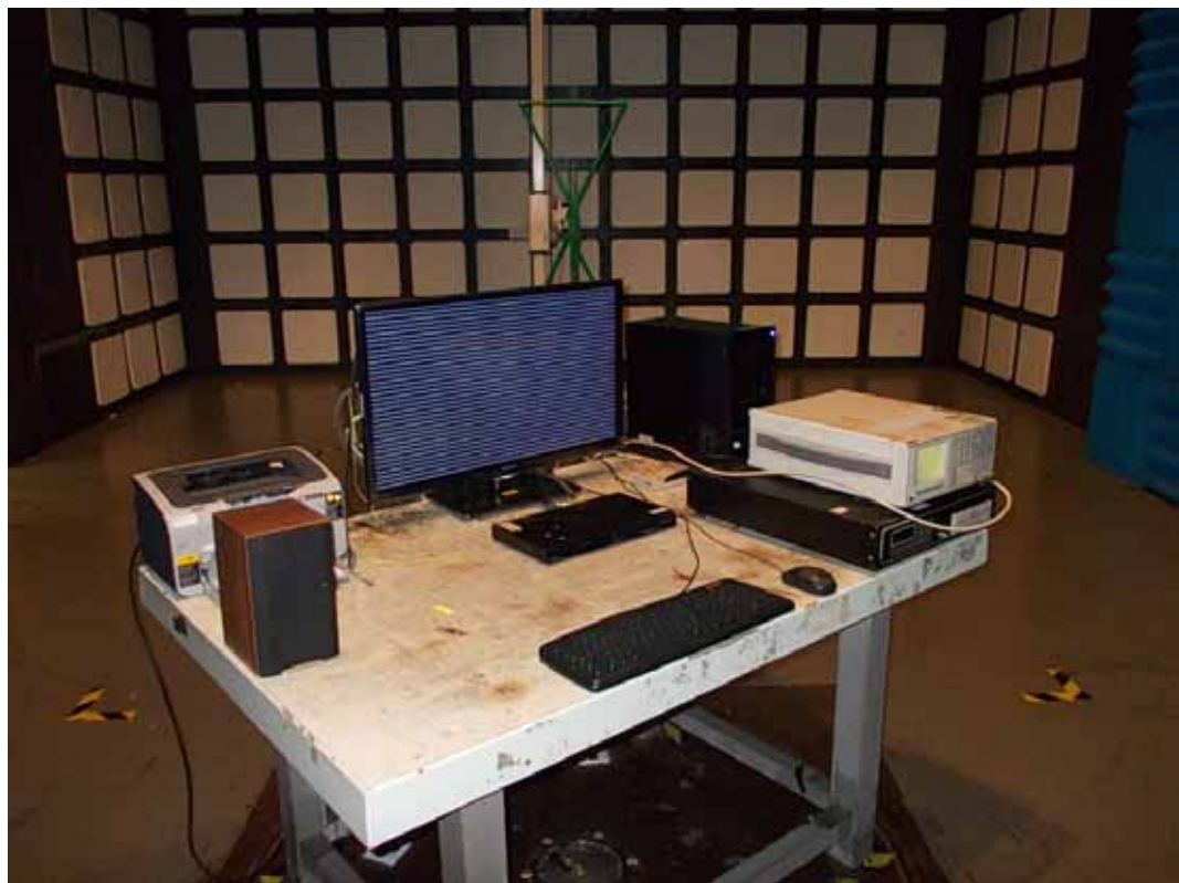
SETUP WITH MAXIMUM DETECTED EMISSION AT VERTICAL POLARIZATION (TEST MODE: D-SUB 1920*1080@60Hz)