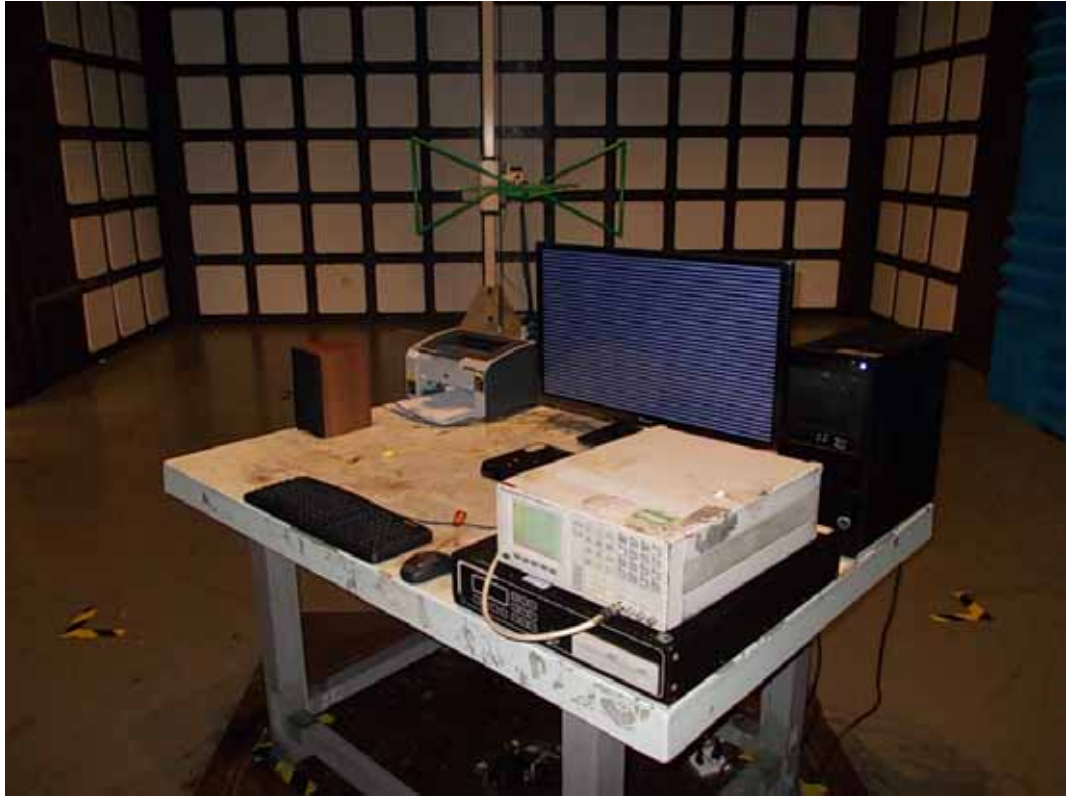
SETUP WITH MAXIMUM DETECTED EMISSION AT HORIZONTAL POLARIZATION (TEST MODE: D-SUB 1920*1080@60Hz)