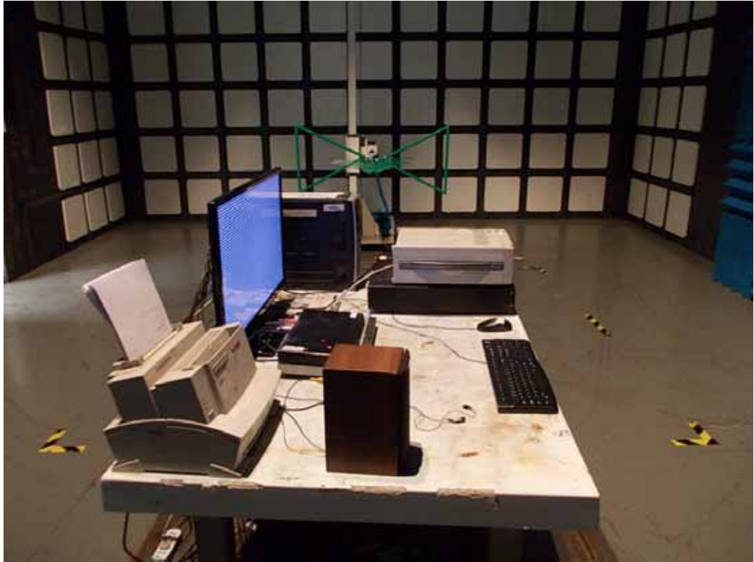
SETUP WITH MAXIMUM DETECTED EMISSION AT HORIZONTAL POLARIZATION (TEST MODE: D-SUB 1024*768@60Hz)