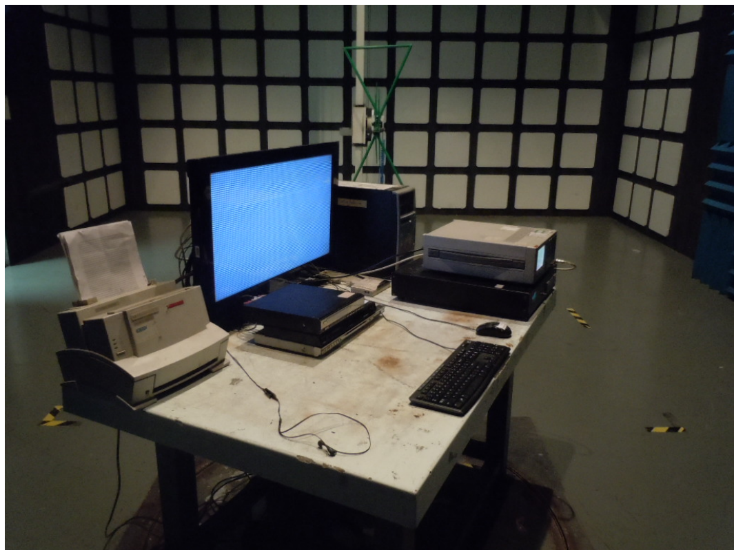
SETUP WITH MAXIMUM DETECTED EMISSION AT VERTICAL POLARIZATION (TEST MODE: USB PLAY)