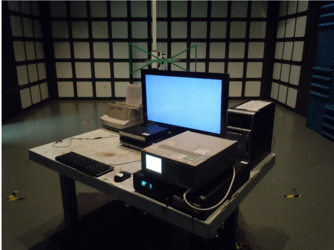
SETUP WITH MAXIMUM DETECTED EMISSION AT HORIZONTAL POLARIZATION (TEST MODE: USB PLAY)