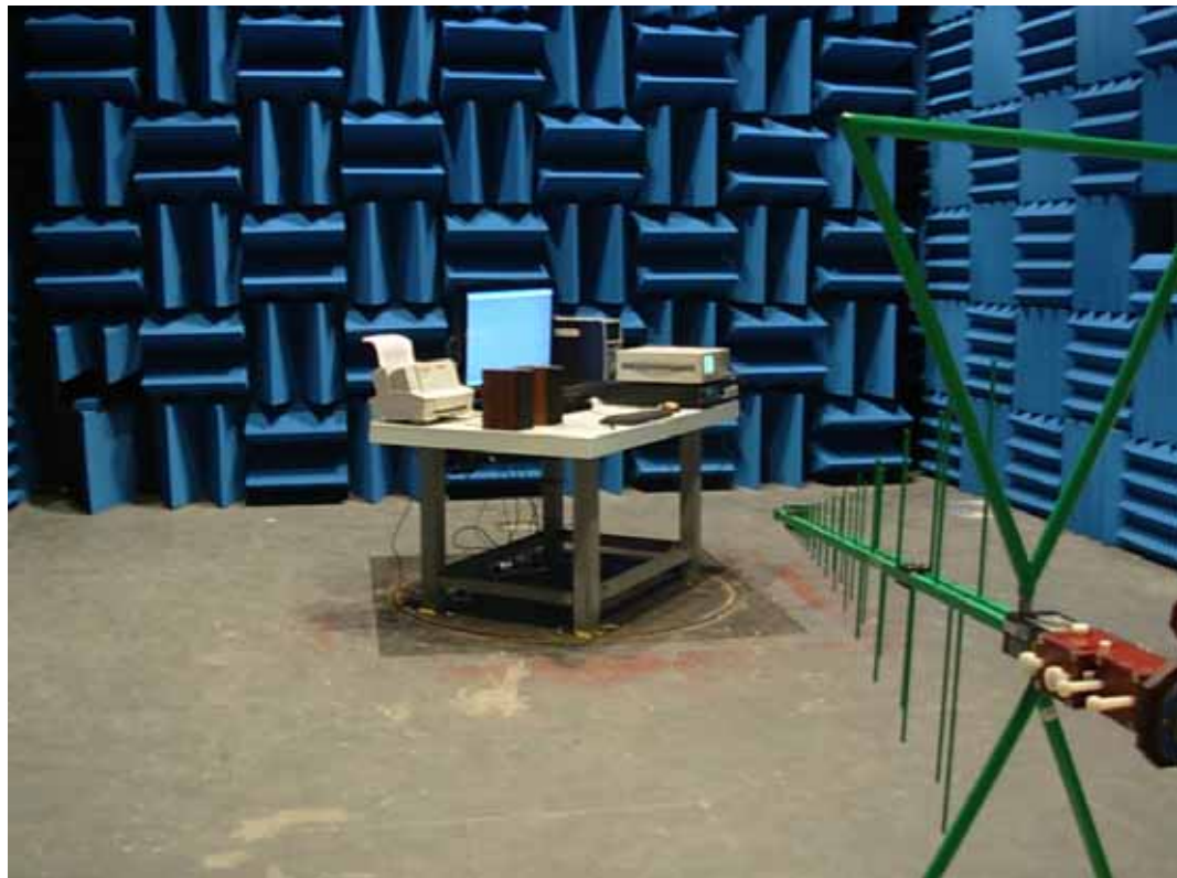
SETUP WITH MAXIMUM DETECTED EMISSION AT VERTICAL POLARIZATION (D-SUB 800*600@60Hz )