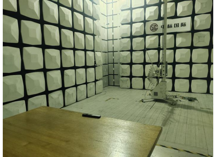
Radiated Emission Below 1GHz