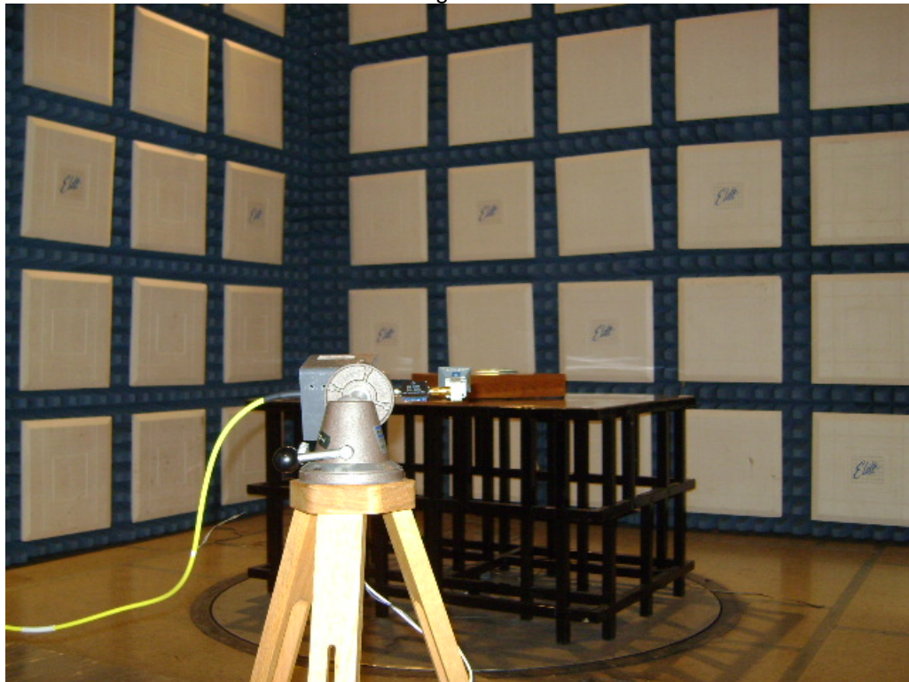
Test Setup for Radiated Emissions – 18GHz to 25GHz - Horizontal Polarization