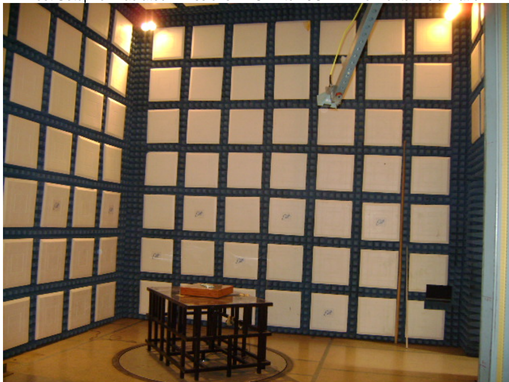
Test Setup for Radiated Emissions – 2GHz to 18GHz - Vertical Polarization