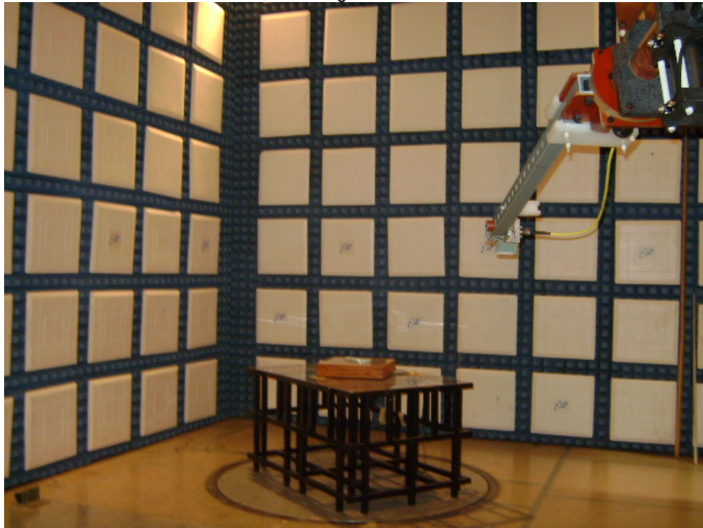
Test Setup for Radiated Emissions – 2GHz to 18GHz – Horizontal Polarization