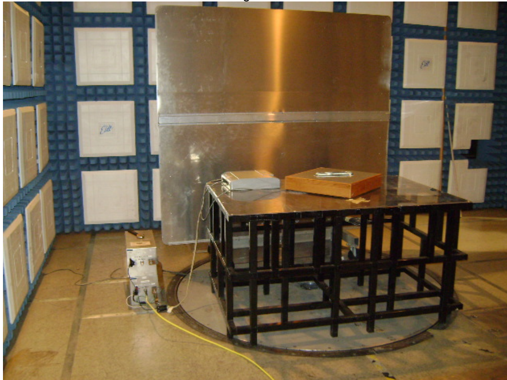
Test Setup for Conducted Emissions