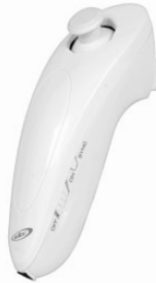
Wireless Nunchuk (Sender Module)

Nintendo® Wii™ is a registered trademark of Nintendo of America. This item is produced by Intec and is not manufactured, sponsored, endorsed or distributed by Nintendo of America.