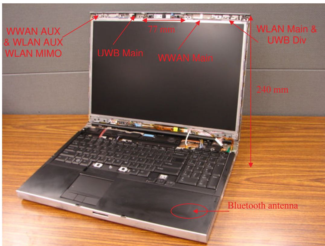
Diagram of the WWAN, WLAN and Bluetooth transmitters' antennas locations: