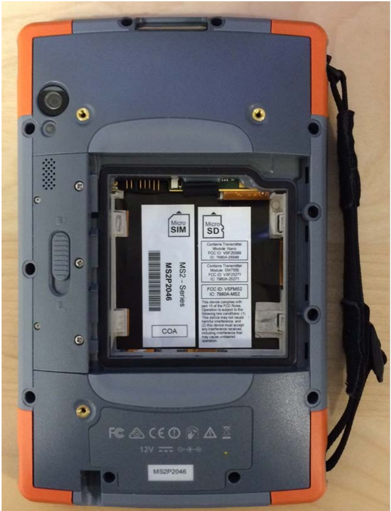
Figure 3: Sample Label Location