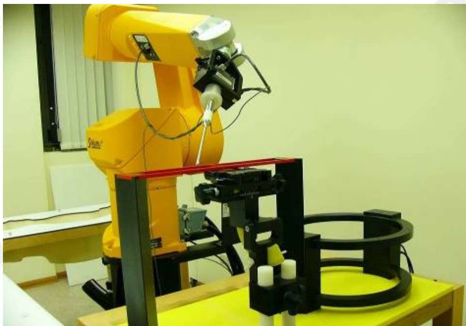
Fig.1 Photograph of the DASY 4 measurement System