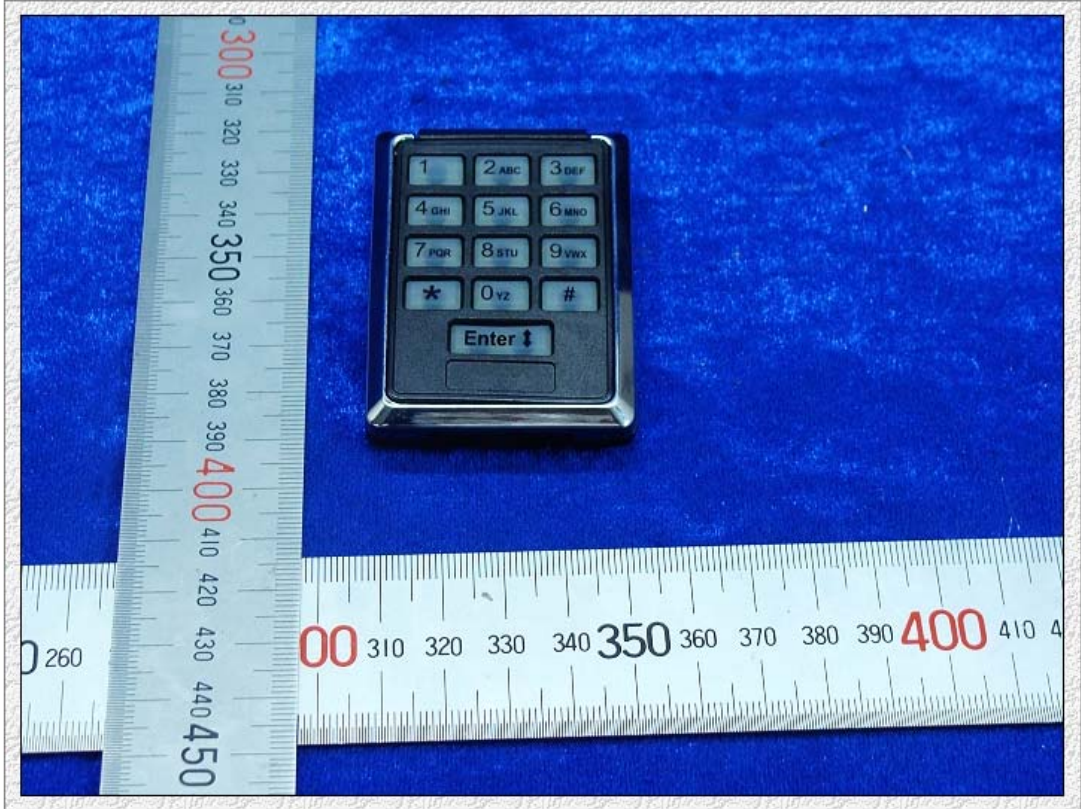
DSC-H10 F4.0 1/10s ISO400

The report refers only to the sample tested and does not apply to the bulk. This report is issued in confidence to the client and it will be strictly treated as such by the Shenzhen Timeway Technology Consulting Co., Ltd. It may not be reproduced in its entirety or in part and it may not be used for advertising. The client to whom the report is issued may, however, show or send it, or a certified copy thereof prepared by the Shenzhen Timeway Technology Consulting Co., Ltd. to his customer, supplier or other persons directly concerned. Shenzhen Timeway Technology Consulting Co., Ltd. will not, without the consent of the client, enter into any discussion of correspondence with any third party concerning the contents of the report. In the event of the improper use of the report, the Shenzhen Timeway Technology Consulting Co., Ltd. reserves the rights to withdraw it and to adopt any other remedies which may be appropriate.