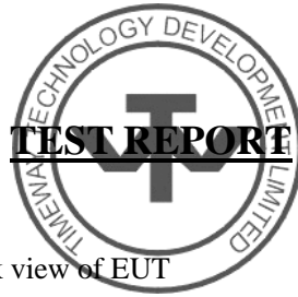
Back view of EUT