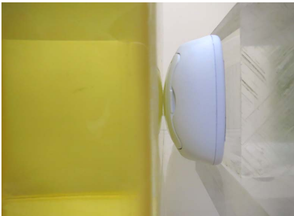
MBP160 Parent Unit Back surface with 0mm separation