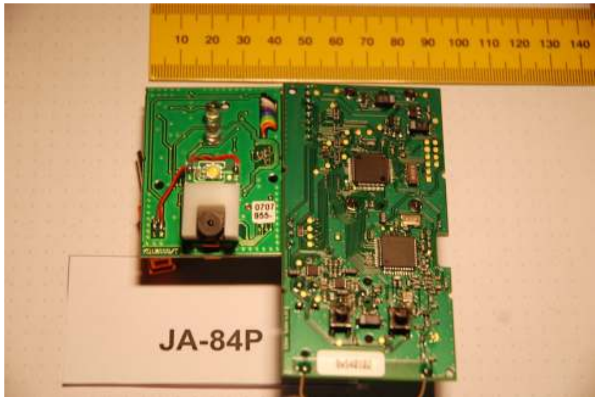
Rear side of PCB's