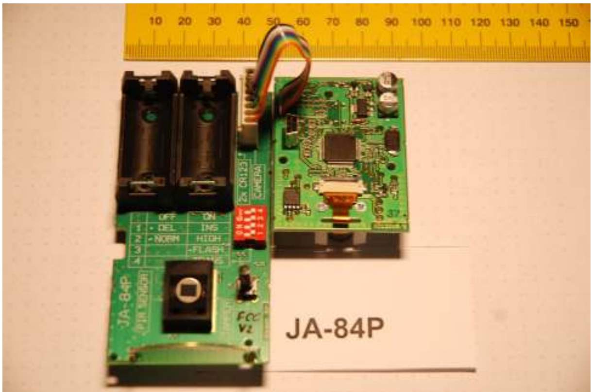
PCB's without plastic cover