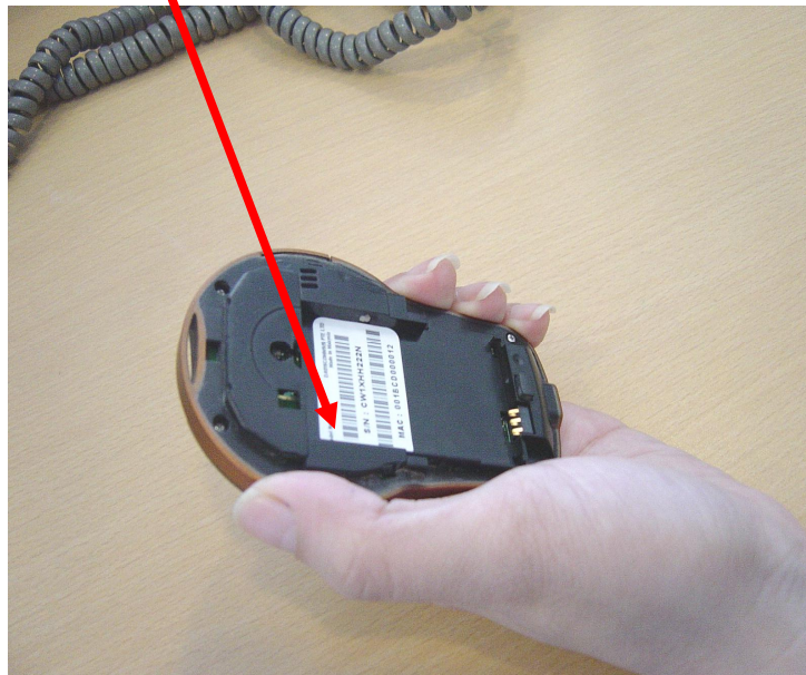
Physical Location of FCC Label on EUT