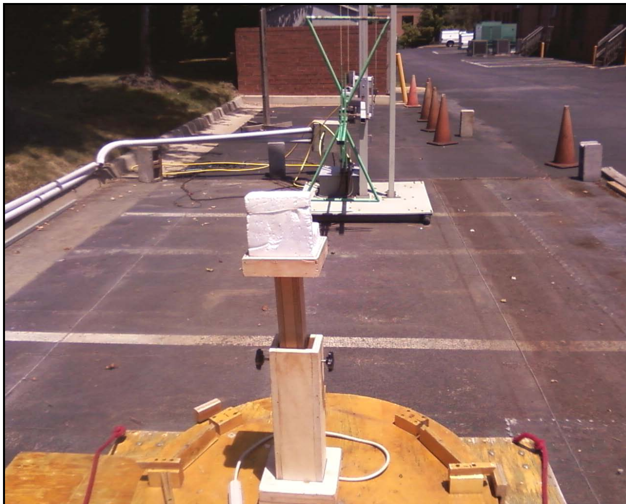
Photograph 4: Radiated Emissions – Back View

Client: Sequel Technologies LLC Model: STWS-DWS-SLIM Standard: FCC 15.231 FCC ID: V4X-SLIMDWS Report #: 2009214