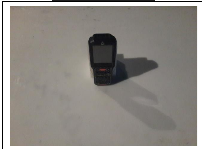
EUT Position: Z-axis