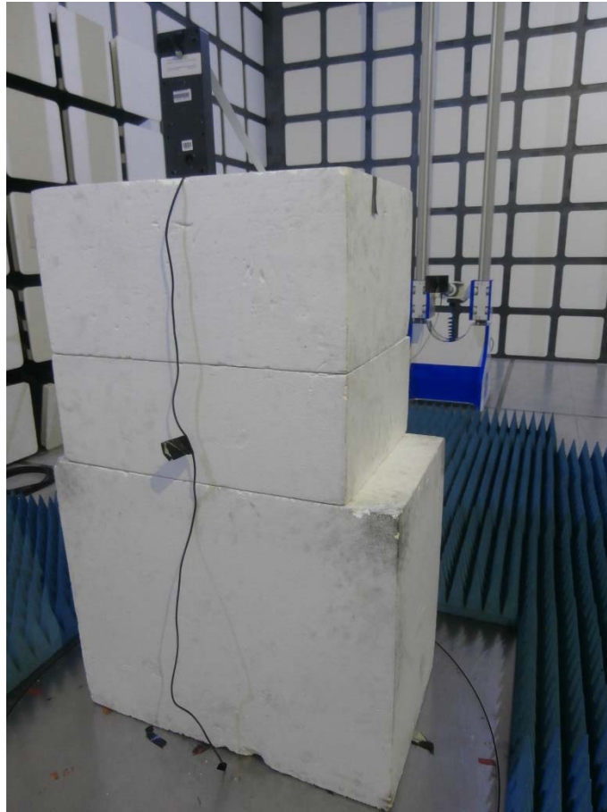
Radiated Emissions 1 GHz to 3 GHz