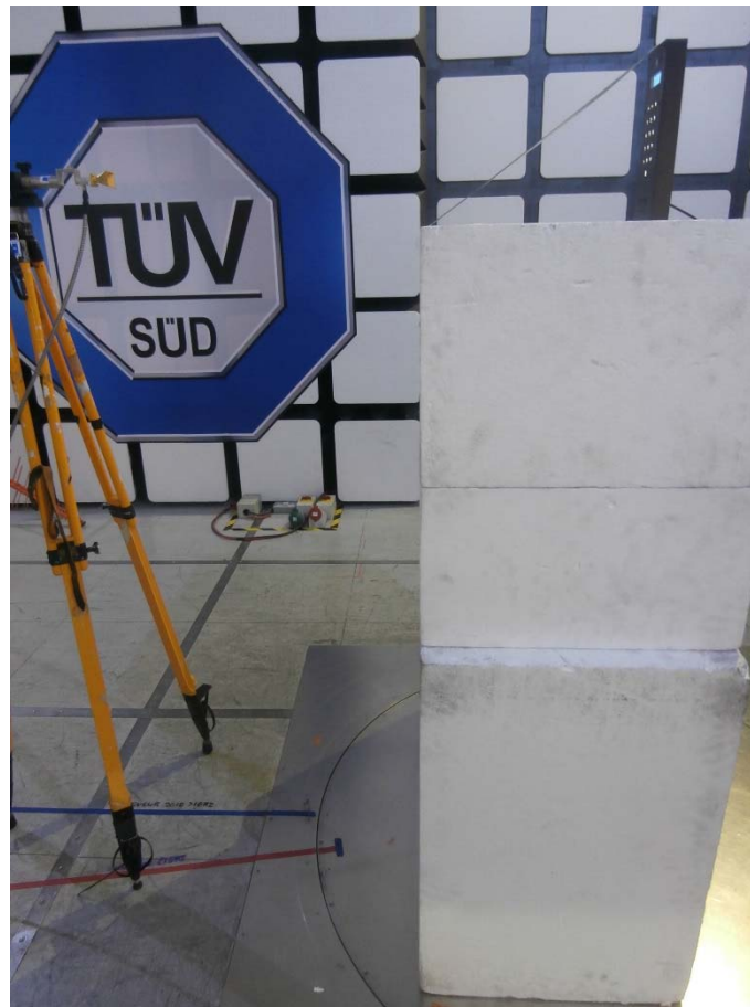
Radiated Emissions 18 GHz to 25 GHz