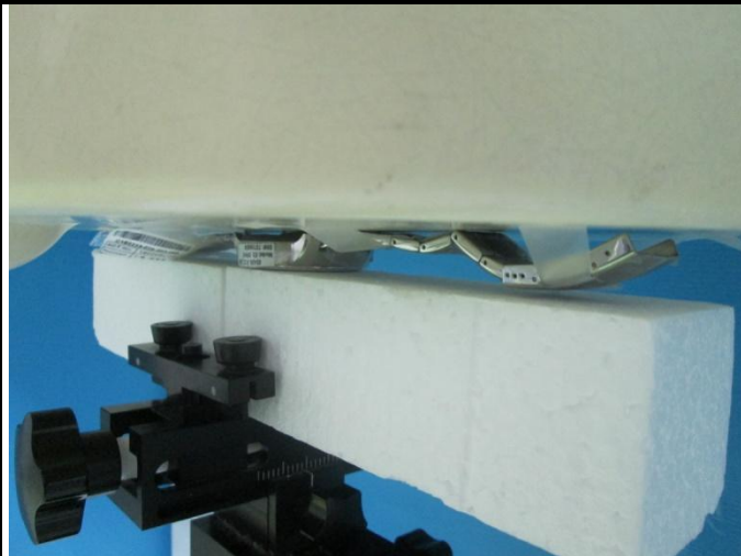
Rear Face of EUT at 0 mm