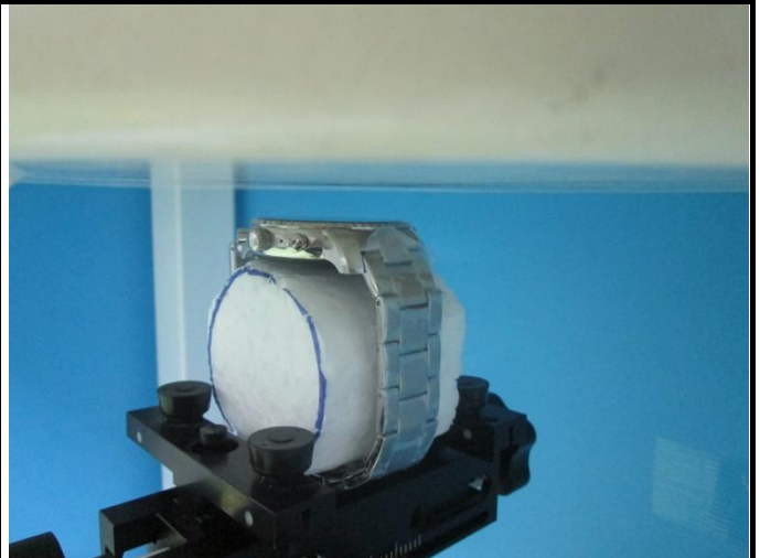
Front Face of EUT at 10 mm