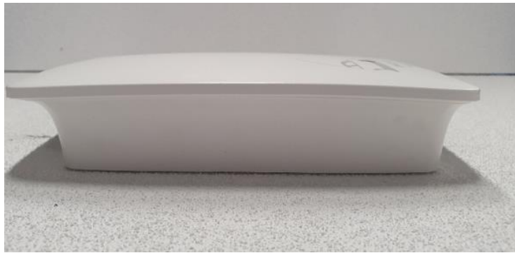
Side view Right