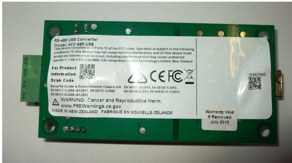
Ancillary: RS-485 to USB to Serial convertor board