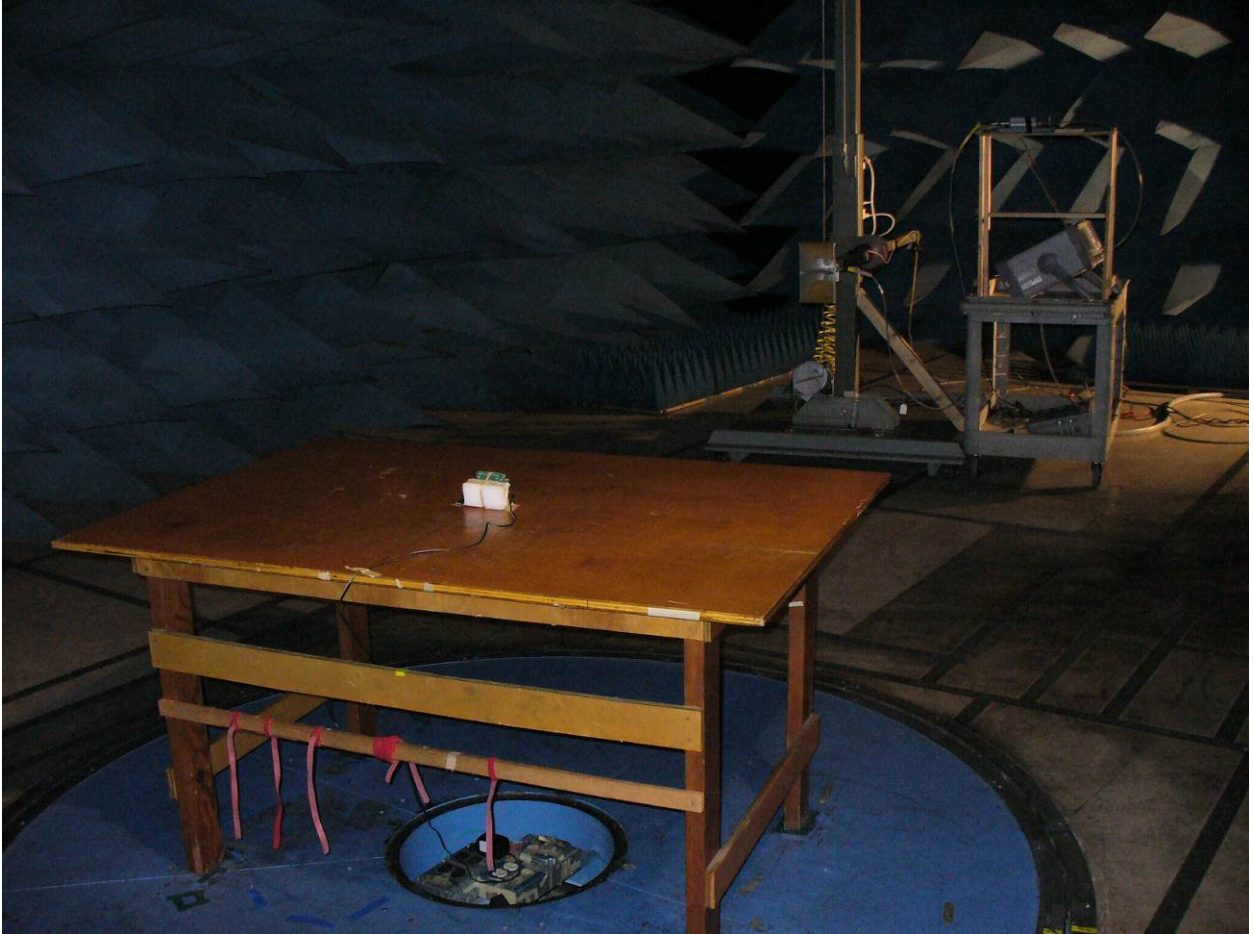
Figure 2: Radiated Emissions – Back View– Internal Antenna