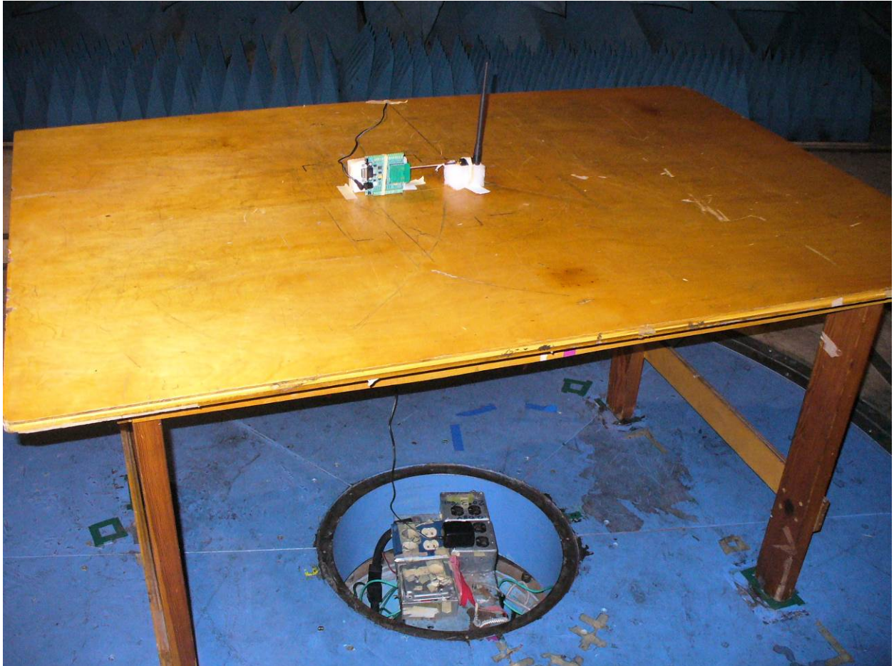
Figure 3: Radiated Emissions – Front View – External Antenna