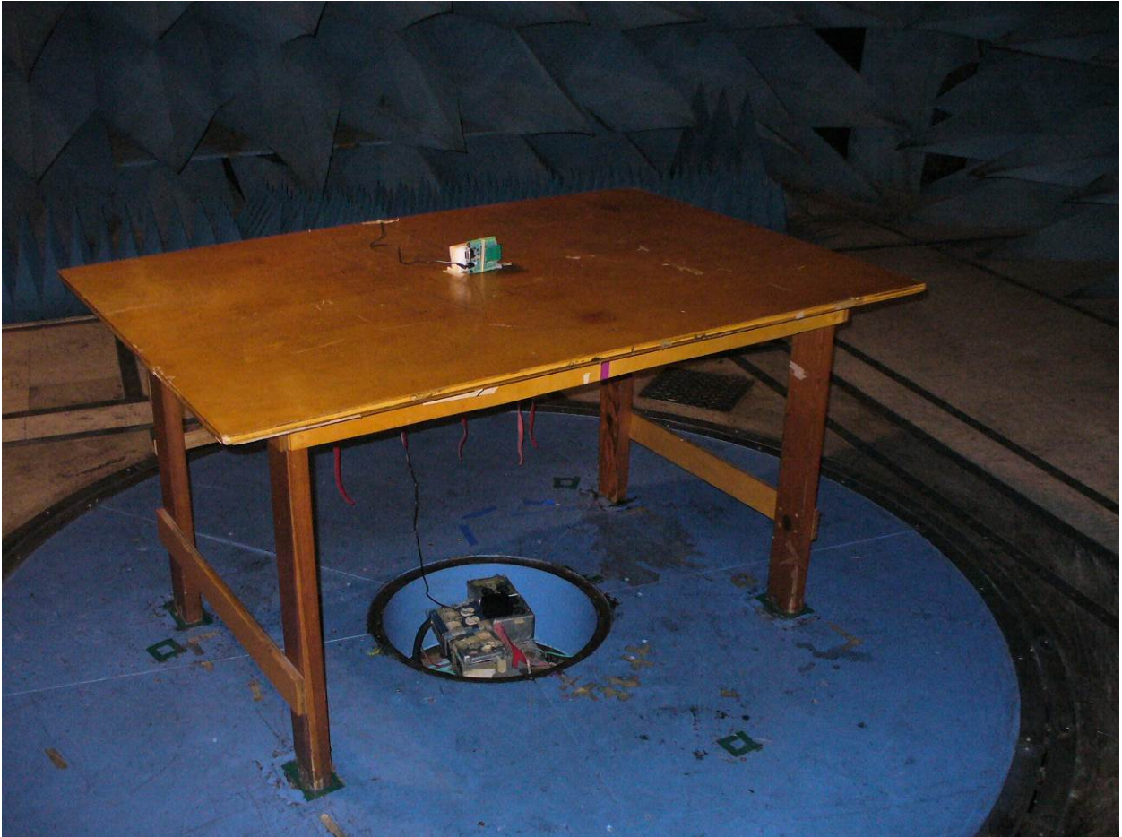
Figure 1: Radiated Emissions – Front View – Internal Antenna