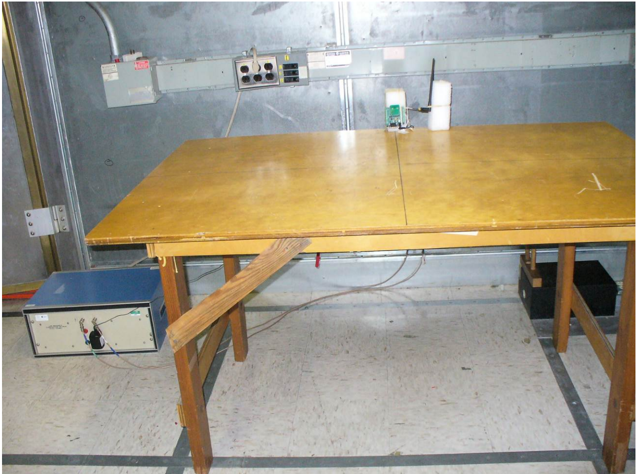
Figure 6: Power Line Conducted Emissions – Front View