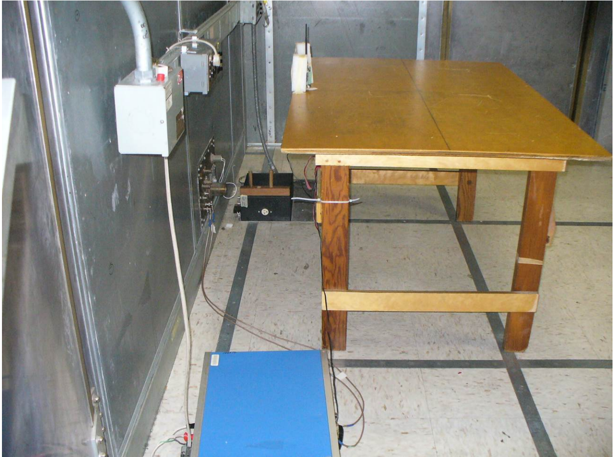
Figure 7: Power Line Conducted Emissions – Side View