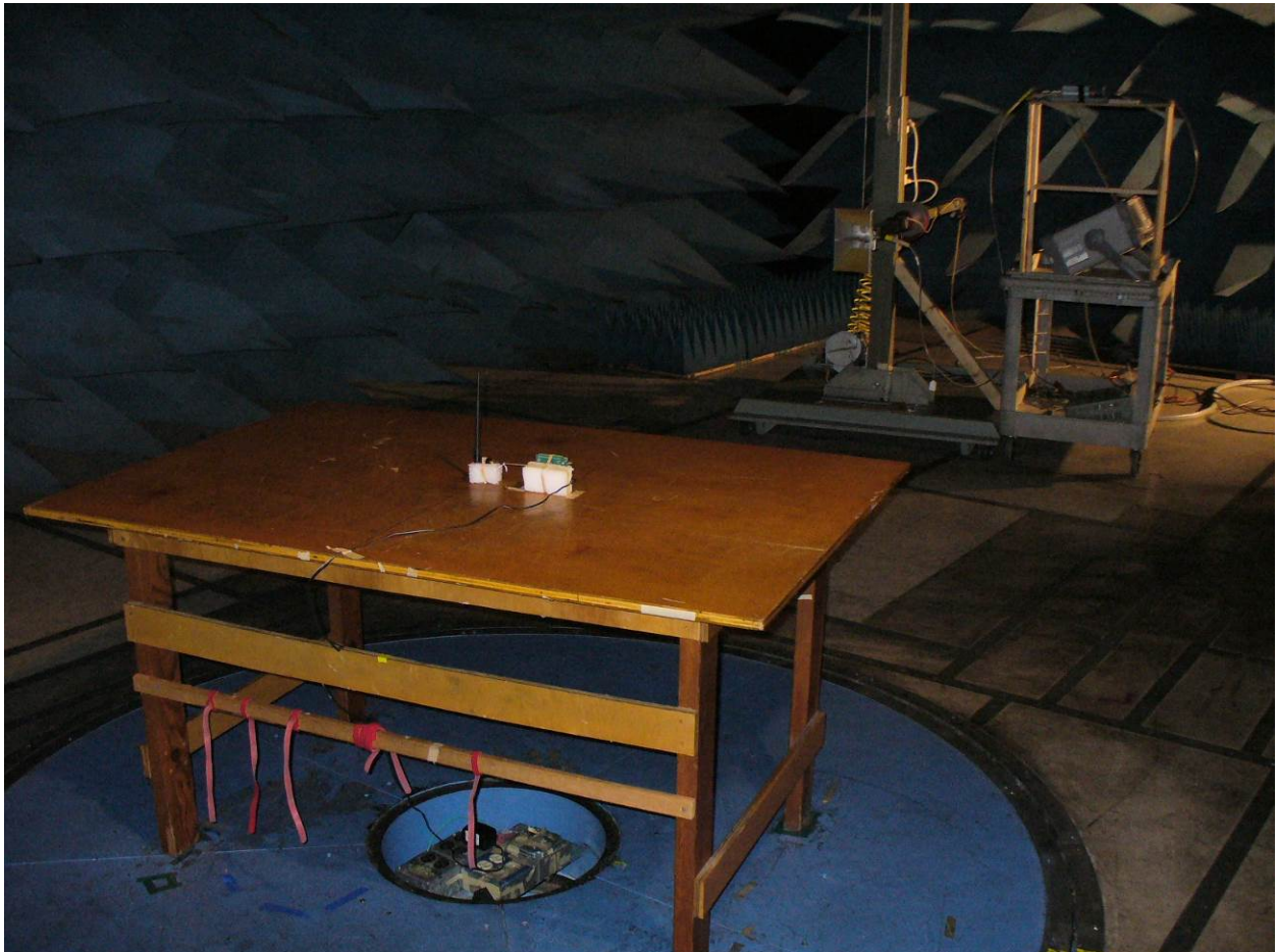
Figure 4: Radiated Emissions – Back View – External Antenna