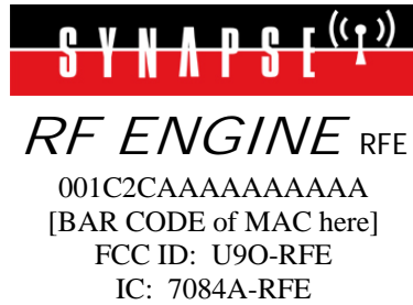
Figure 1: Label Information – Sample Label

The label will be applied to the module via silkscreen. Compliance statements and OEM labeling instructions provided in user's manual.