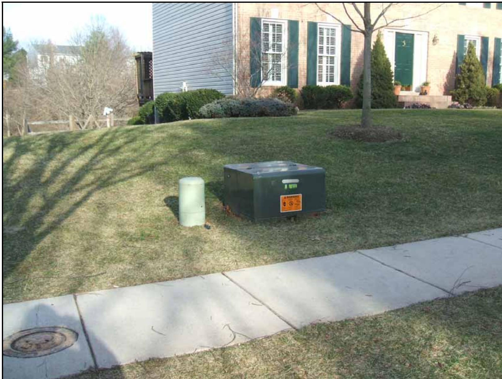
Photograph B-3: Test Site Photo – CURRENT Group Gaithersburg Test Area – A-9204 (external)