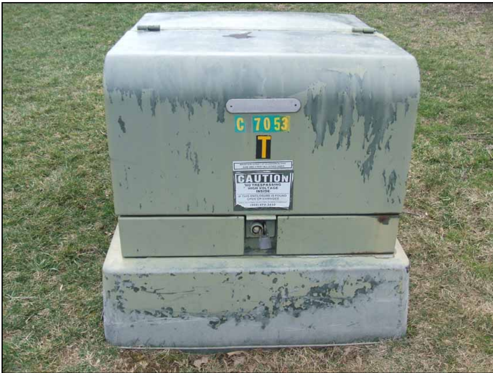
Photograph B-1: Test Site Photo – CURRENT Group Potomac Test Area – C-7053 (external)