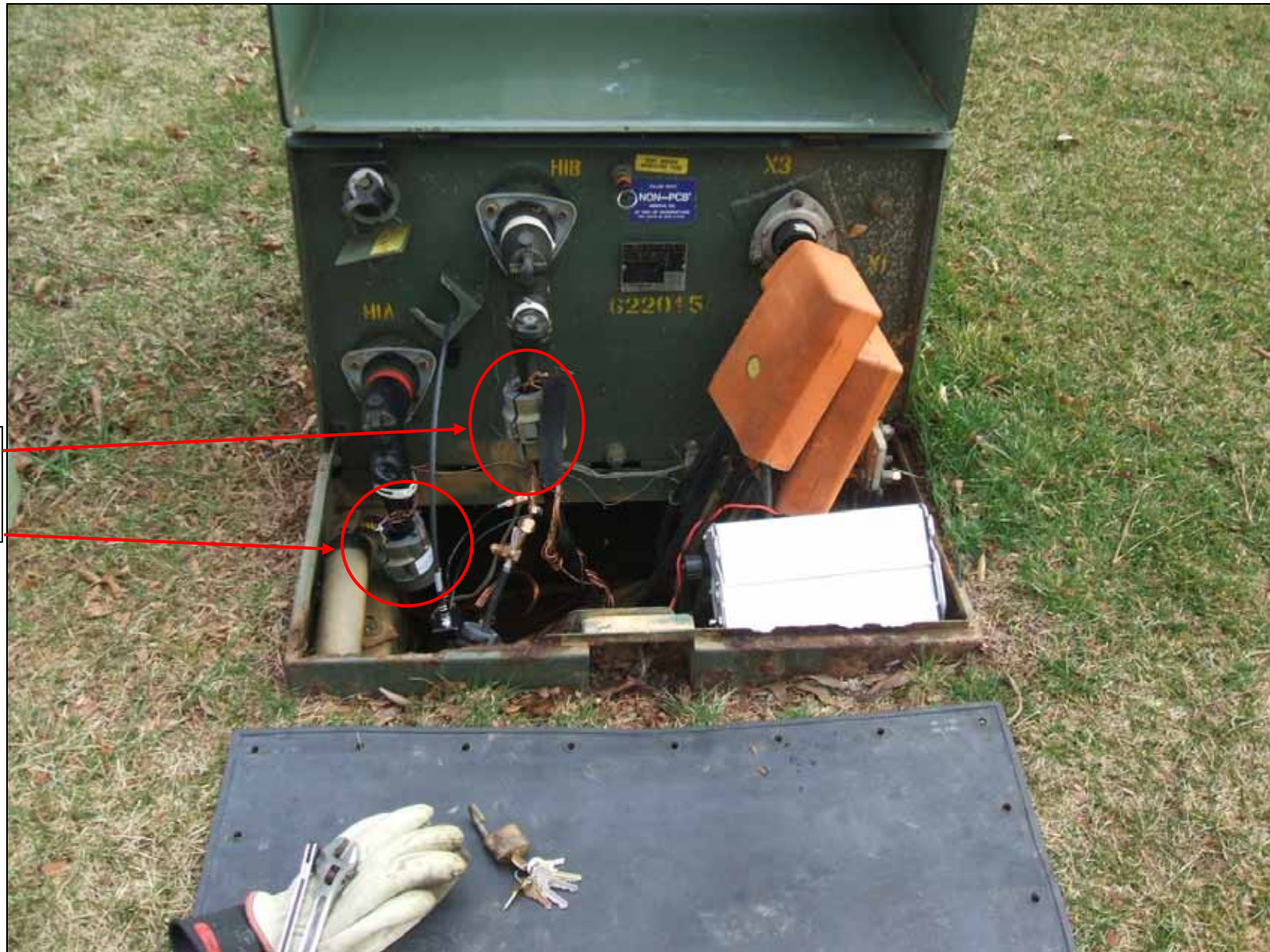
Photograph B-4: Test Site Photo – CURRENT Group Gaithersburg Test Area – A-9204 (open case)