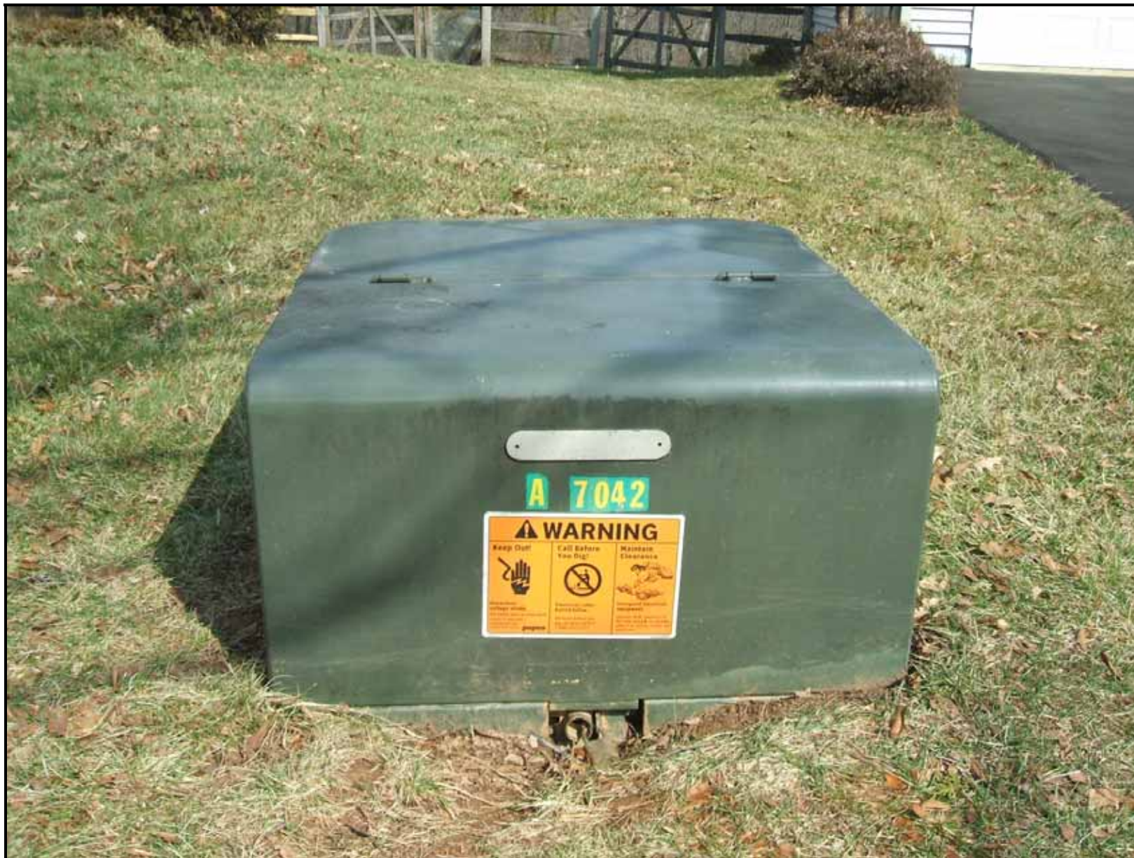
Photograph B-5: Test Site Photo – CURRENT Group Gaithersburg Test Area – A-7042 (external)