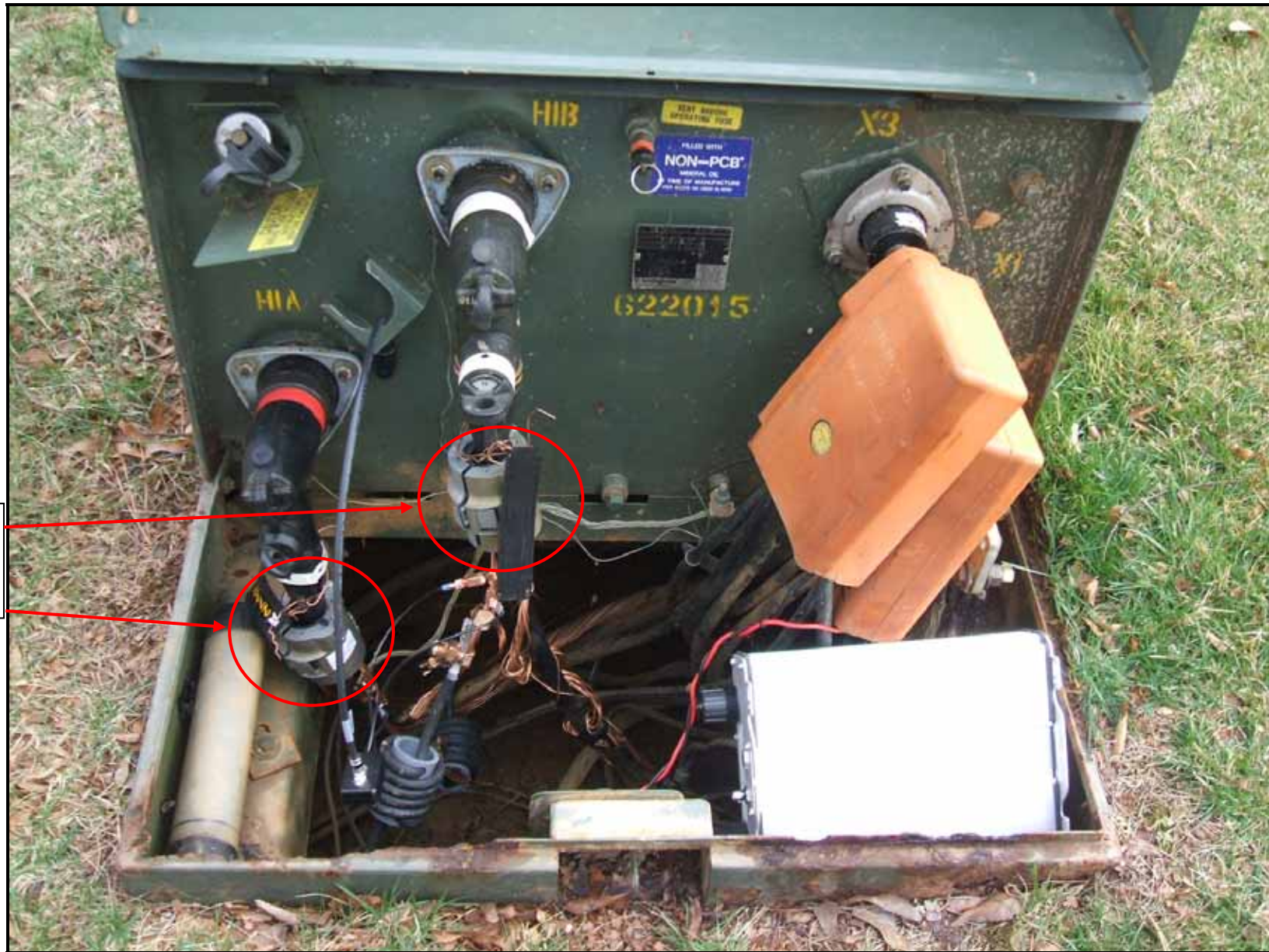
Photograph B-4: Test Site Photo – CURRENT Group Gaithersburg Test Area – A-9204 (open case)