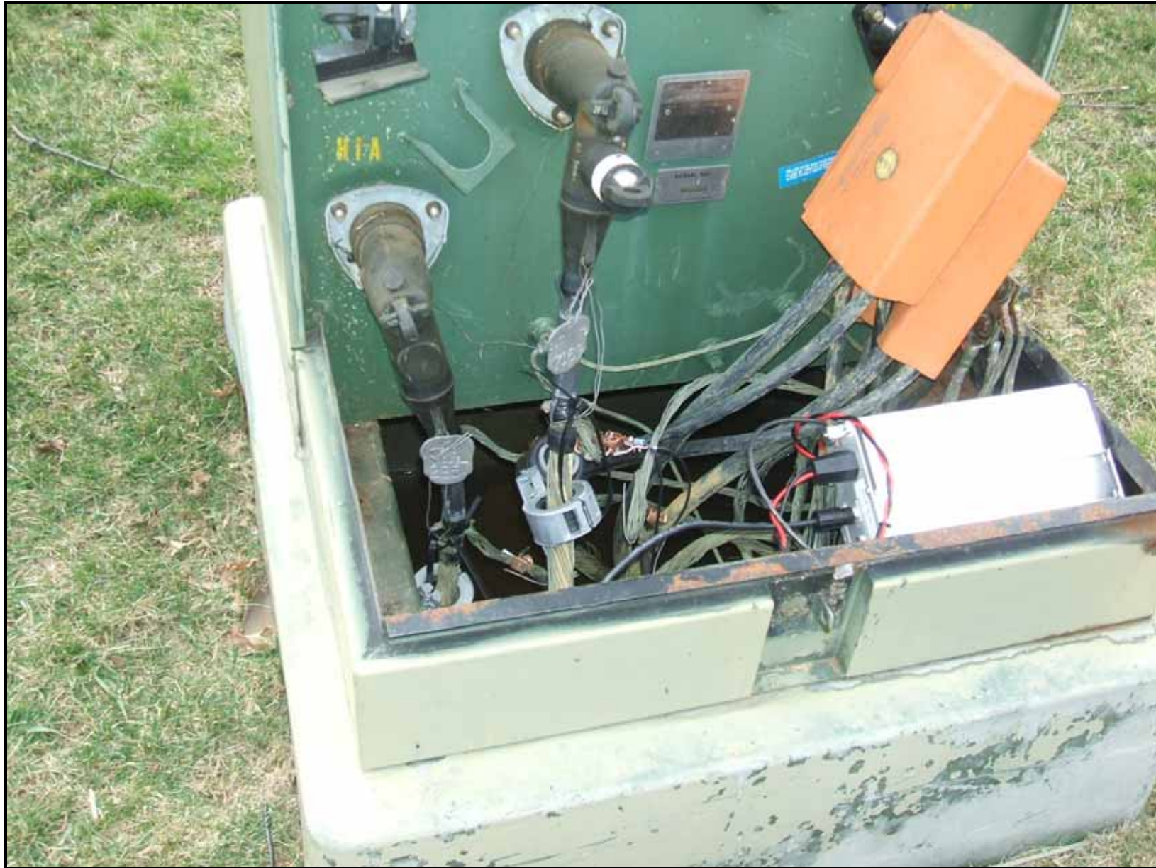
Photograph B-2: Test Site Photo – Group Potomac Test Area – C-7053 (open case)