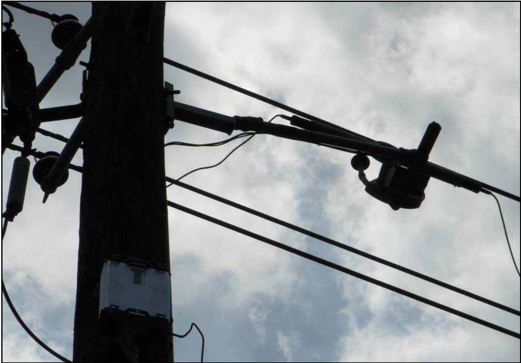
Photograph B-9: Test Site Photo – CURRENT Group Potomac Test Area – Tuckerman (close up shot)