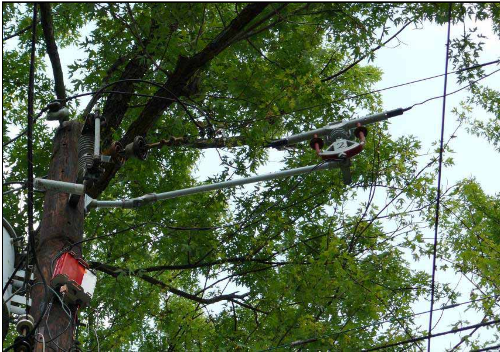
Photograph B-3: Test Site Photo – CURRENT Group Rockville Test Area – PLB2 (close up shot)