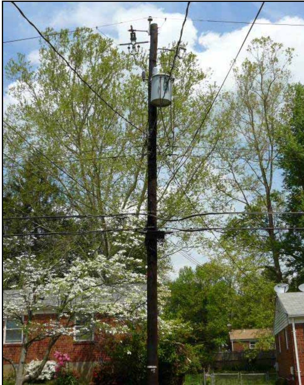
Photograph B-1: Test Site Photo – CURRENT Group Rockville Test Area – PLB1 (distance shot)