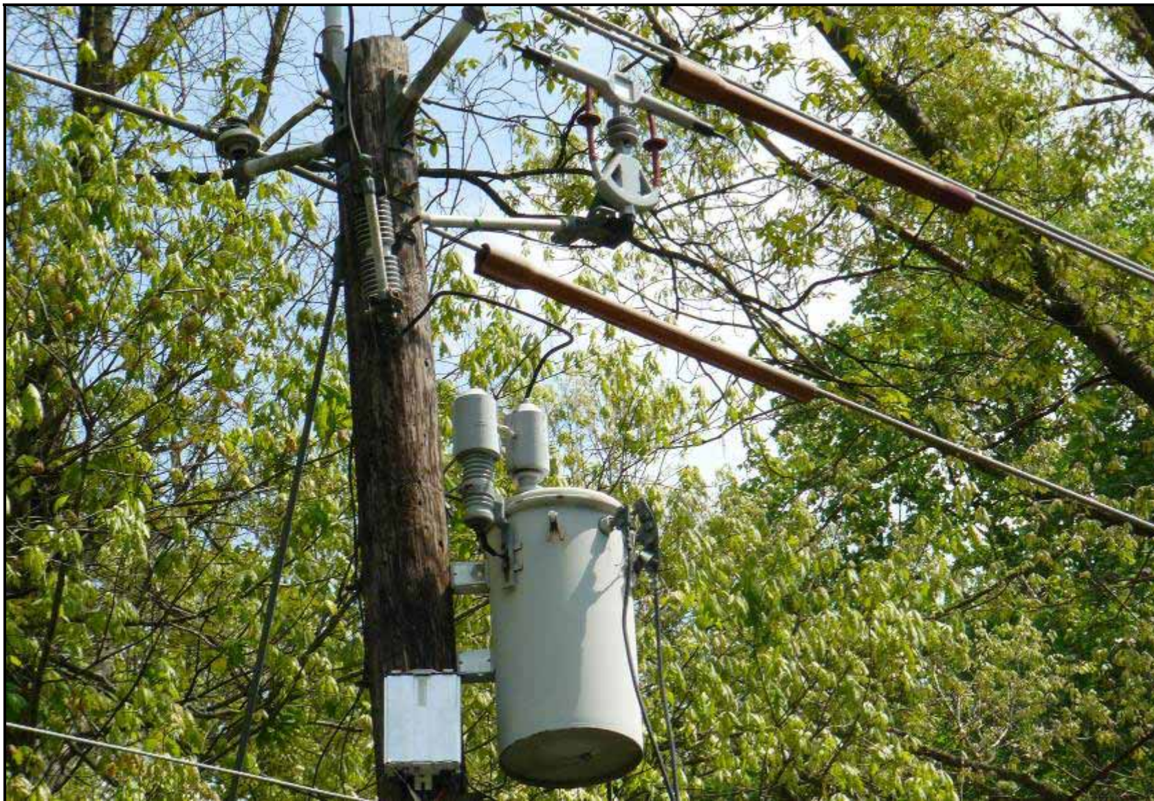
Photograph B-6: Test Site Photo – CURRENT Group Potomac Test Area – 9417 Kentsdale (close up shot)