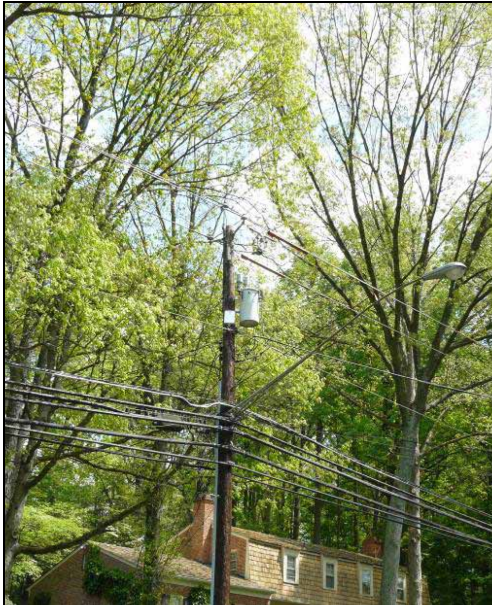
Photograph B-6: Test Site Photo – CURRENT Group Potomac Test Area – 9417 Kentsdale (distance shot)