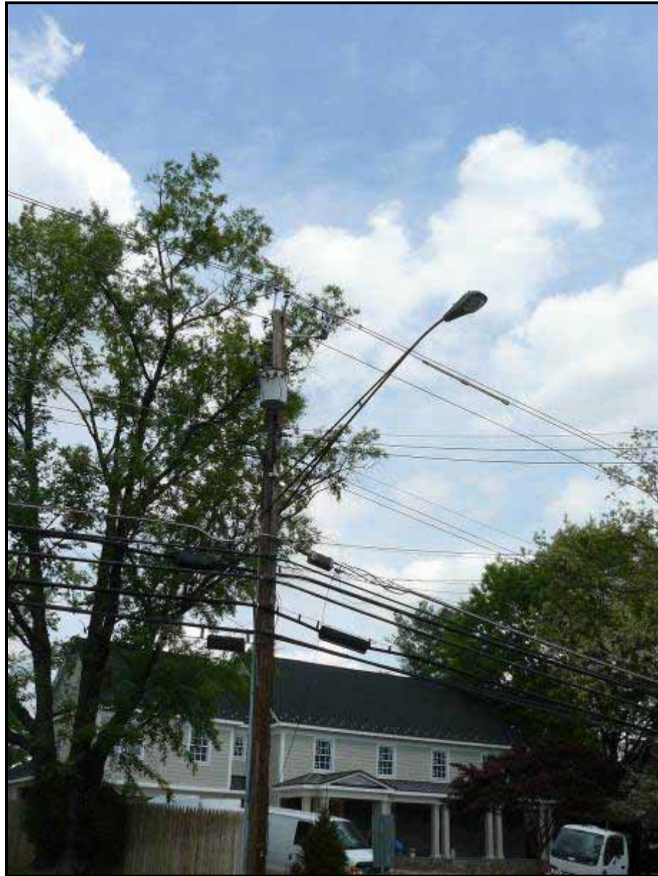
Photograph B-7: Test Site Photo – CURRENT Group Potomac Test Area – 9705 Kentsdale (distance shot)