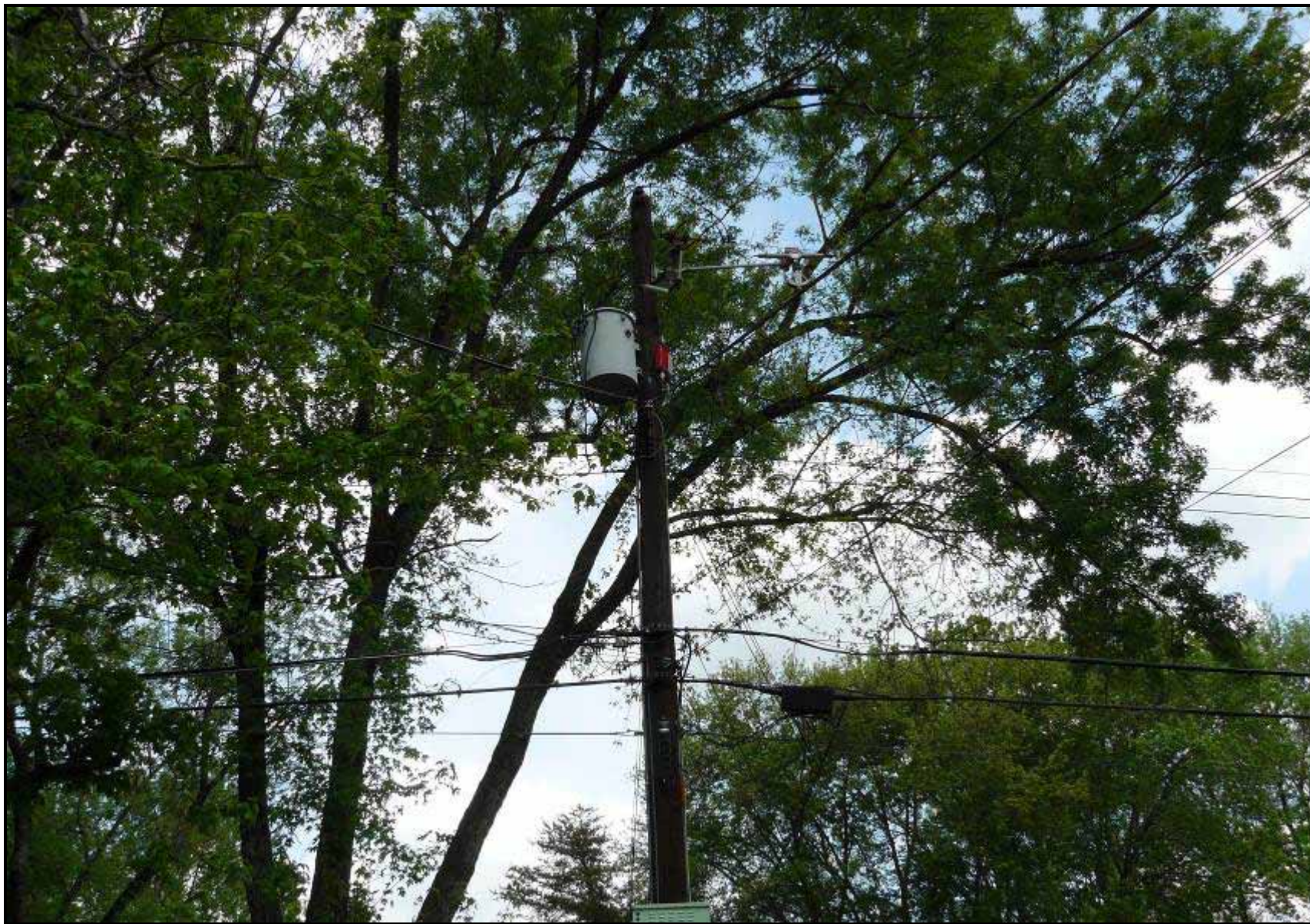
Photograph B-2: Test Site Photo – CURRENT Group Rockville Test Area – PLB2 (distance shot)