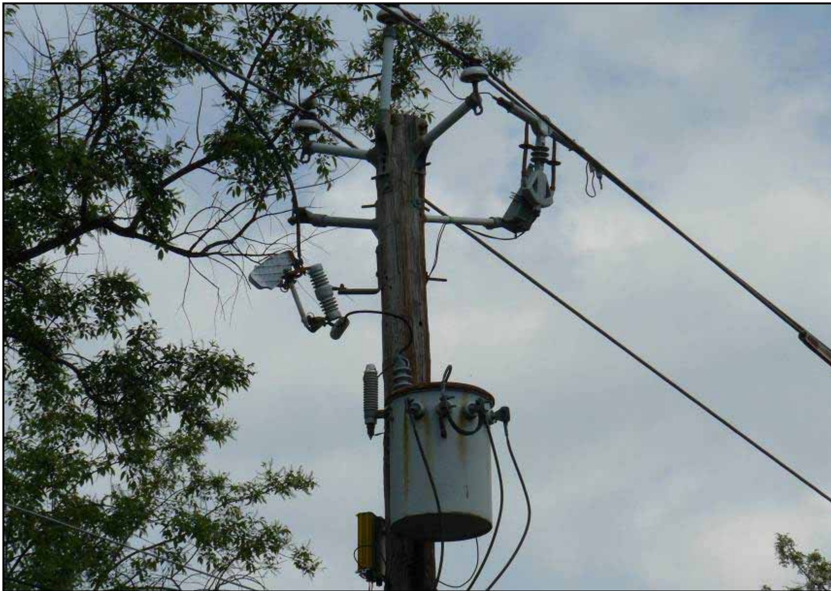
Photograph B-8: Test Site Photo – CURRENT Group Potomac Test Area – 9705 Kentsdale (close up shot)