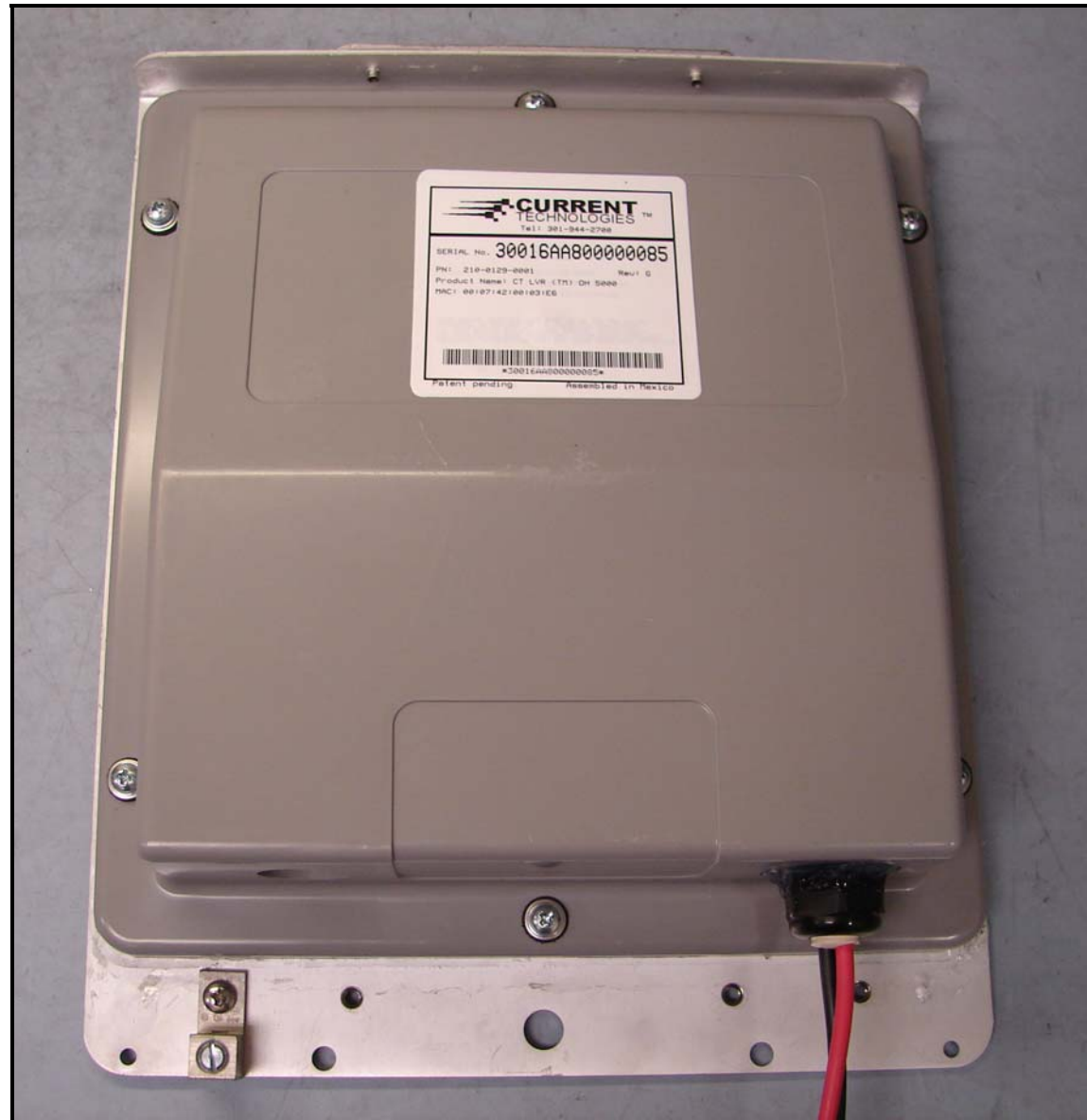
Photograph EP-1: External Photo of CT LVR OH – View of Top Side