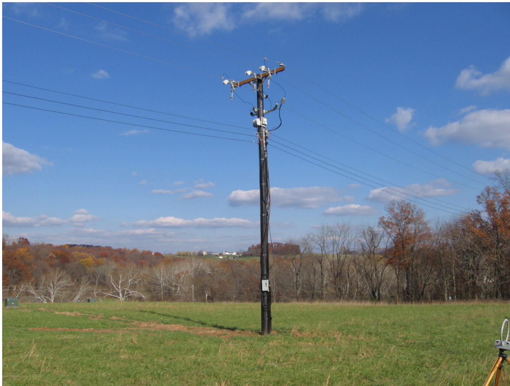
Photograph B-3: Radiated Emissions Test – CURRENT Technologies Field Research and Test Area, Pole P4- Wide View