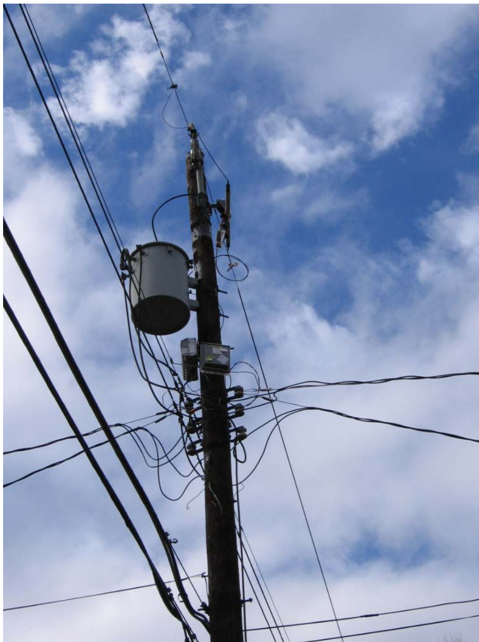
Photograph B-6: Radiated Emissions Test – CURRENT Technologies Rockville Test Area, Macon Road – Close View