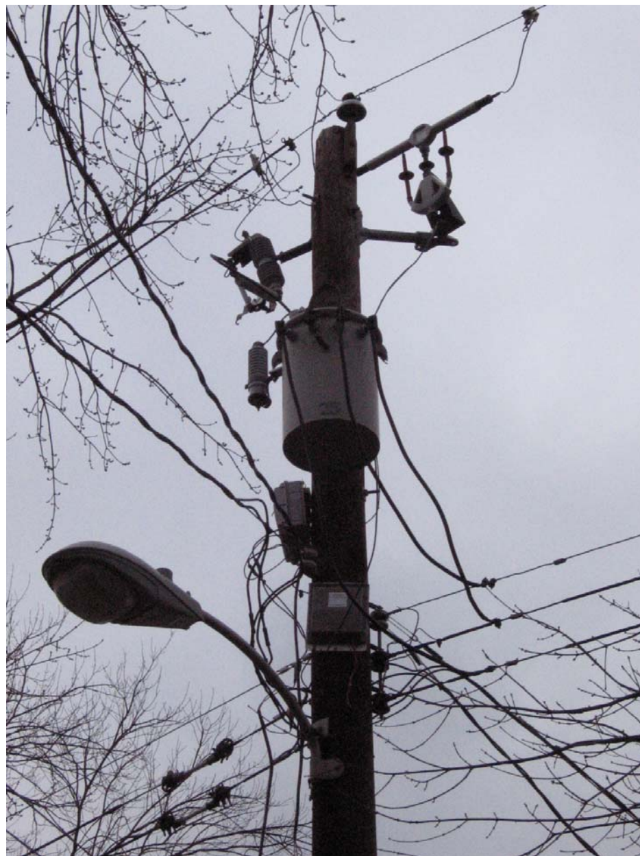
Photograph B-8: Radiated Emissions Test – CURRENT Technologies Rockville Test Area, Old Drovers Way– Close View