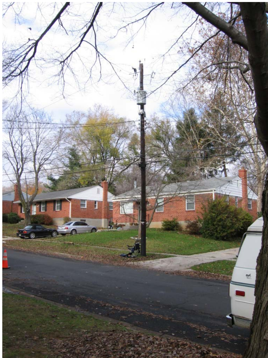
Photograph B-5: Radiated Emissions Test – CURRENT Technologies Rockville Test Area, Macon Road - Wide View