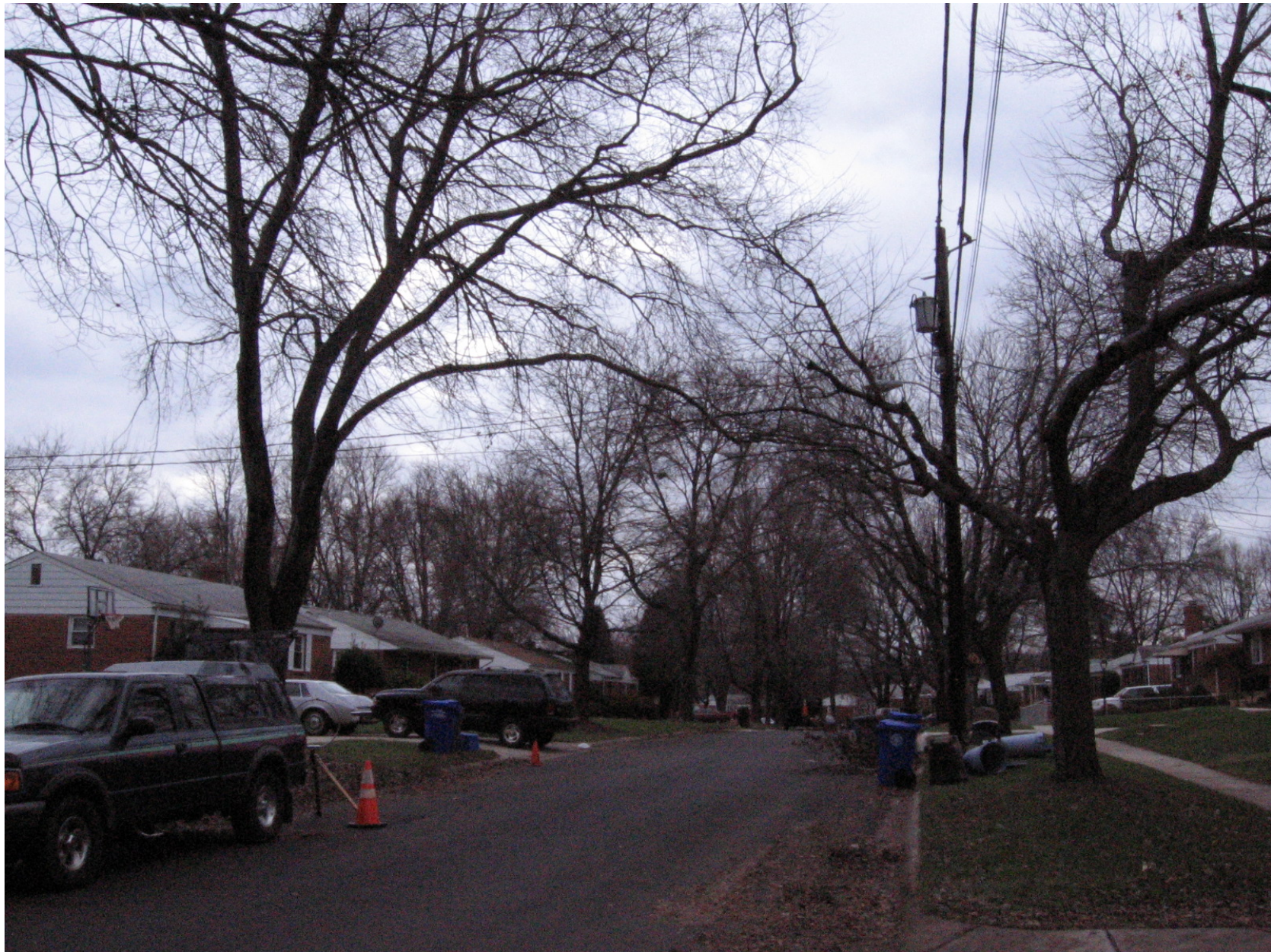
Photograph B-7: Radiated Emissions Test – CURRENT Technologies Rockville Test Area, Old Drovers Way - Wide View