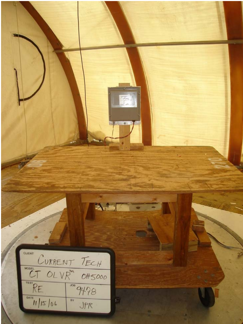
Photograph B-1: Radiated Emissions Test – Washington Laboratories OATS – Front View