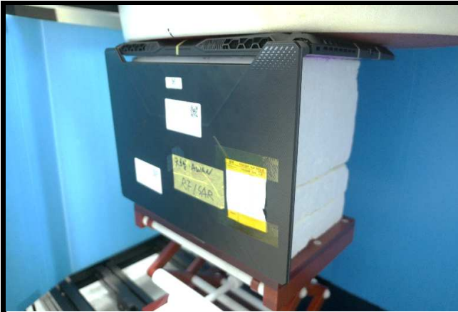
Bottom of Laptop Tested at 0 mm