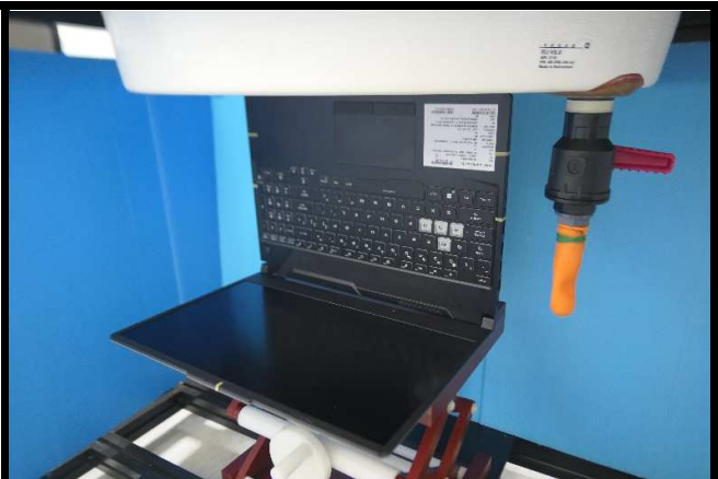
Front Edge of Laptop Tested at 0 mm