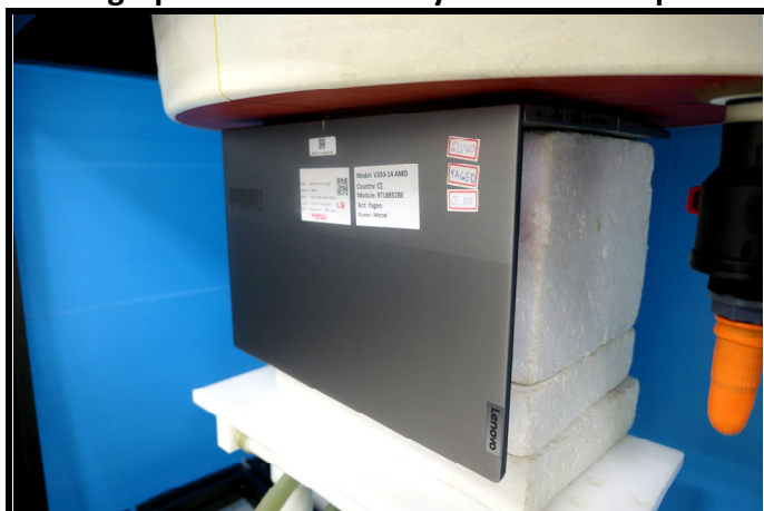
Bottom of EUT Tested at 0 mm