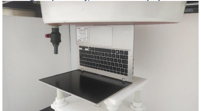
Testing Setup for Body, Front Side of Laptop at 0 mm