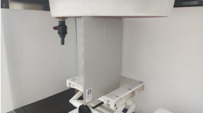
Testing Setup for Extremity, Left Side of Laptop at 0 mm