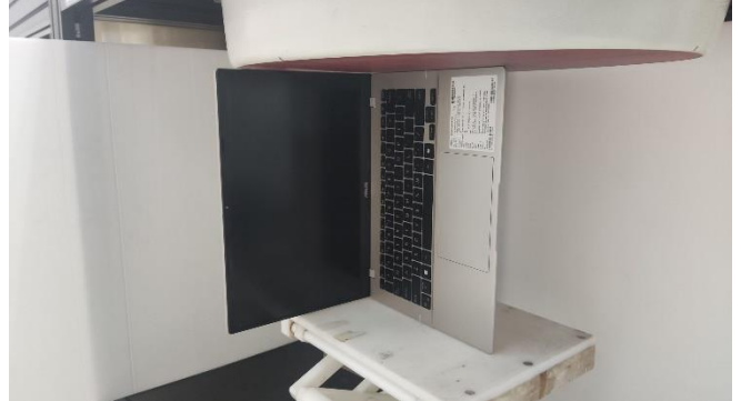
Testing Setup for Extremity, Right Side of Laptop at 0 mm