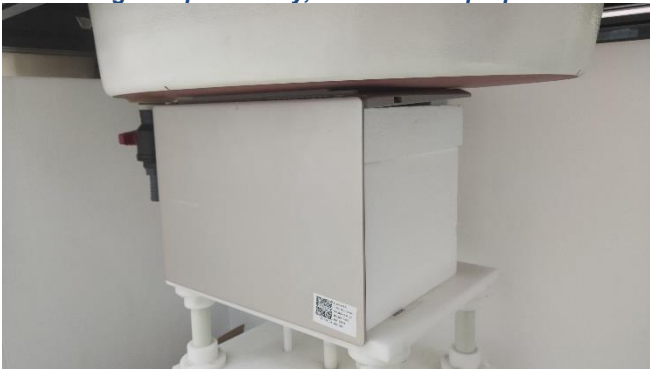
Testing Setup for Body, Bottom of Laptop at 0 mm