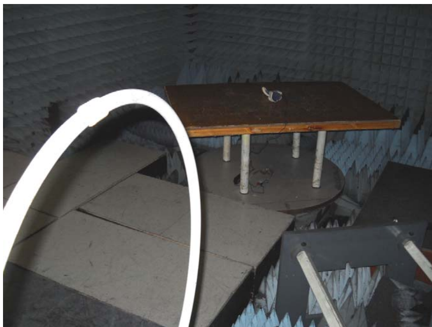
Photograph No.1 Setup for spurious emission field strength measurements below 30 MHz in the anechoic chamber