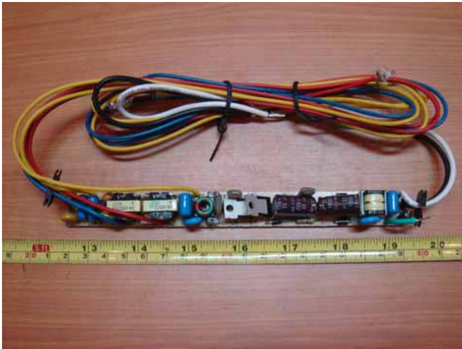
PCB-Back View for 120-1626