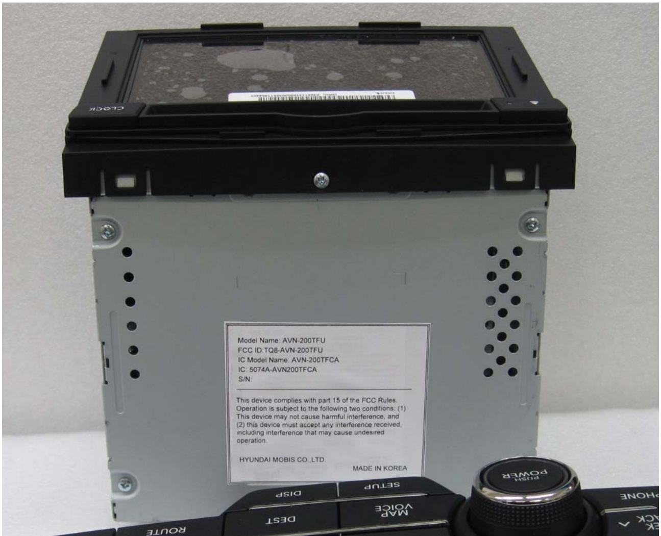
Figure 1.2 LABEL LOCATION

The label shown shall be permanently affixed at a conspicuous location on the device and be readily visible to the user at the time purchase. (Labeling requirements per 2.925)