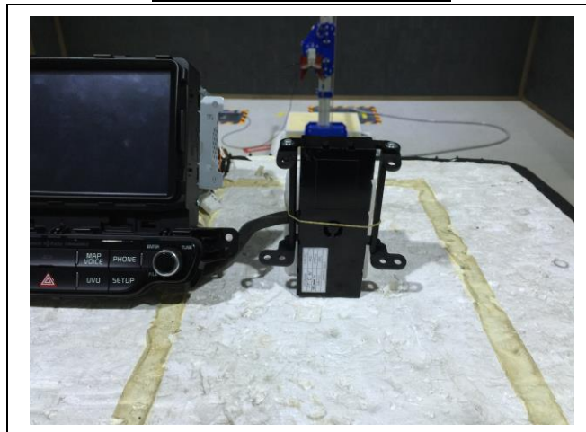
EUT Position: Z-axis