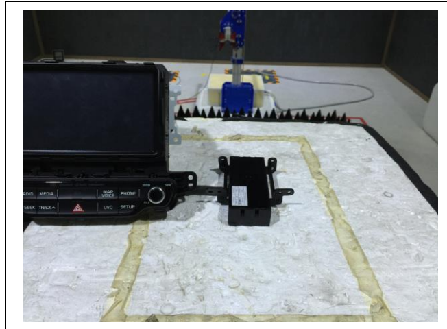
EUT Position: Y-axis