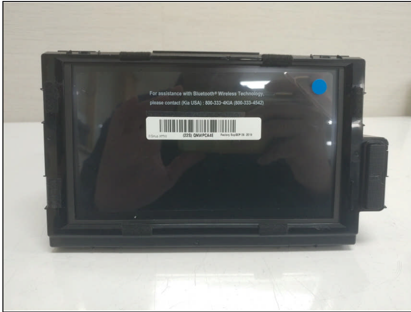
Rear view of EUT