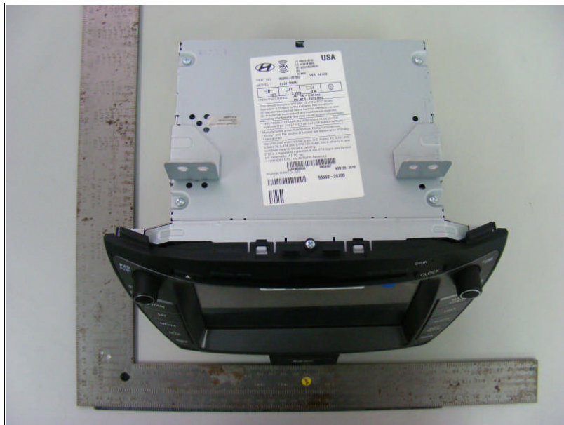
Bottom view of EUT