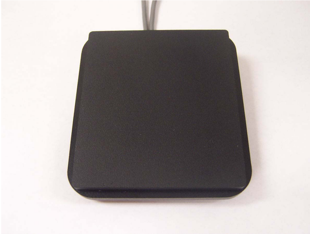
Photograph of the top of a MSU unit