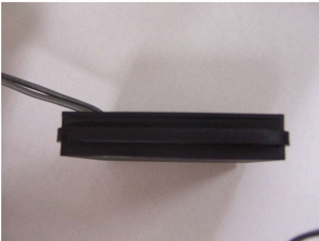
Photo of the side of an MSU unit