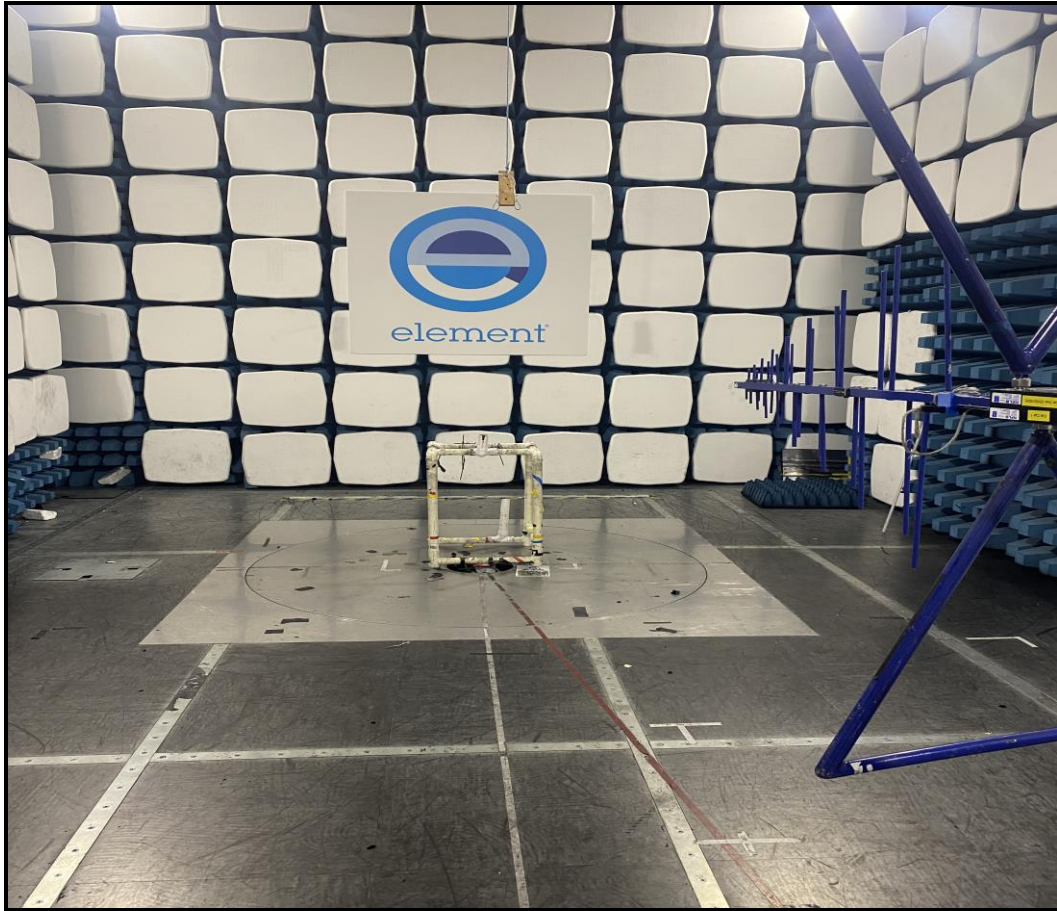
30 MHz to 1 GHz