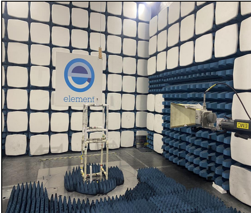
Above 1 GHz