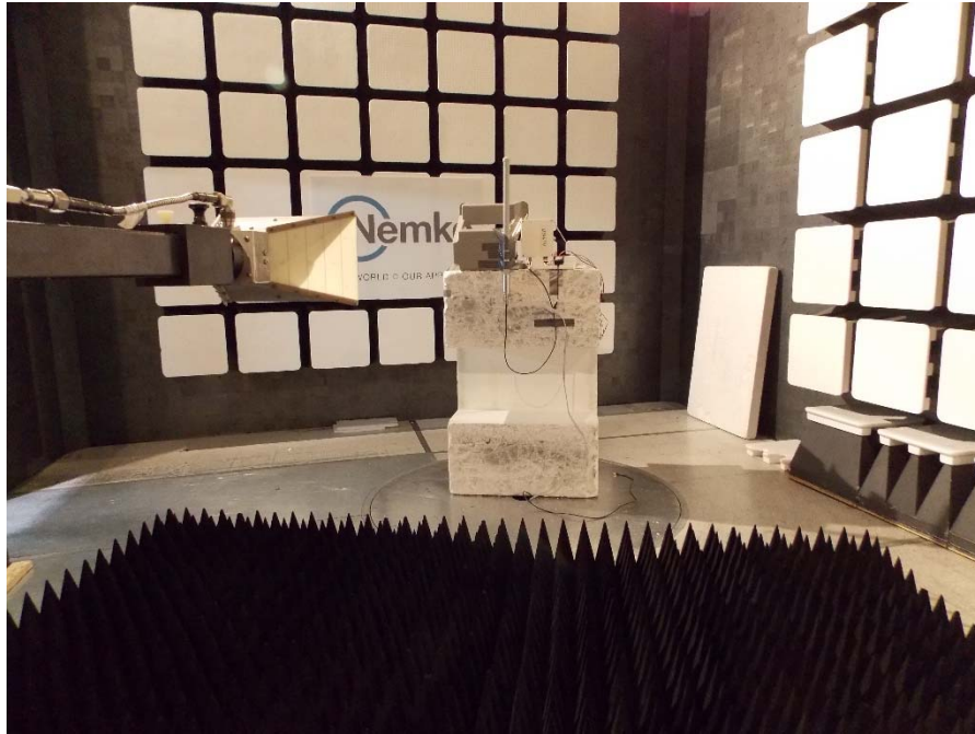
Radiated spurious (out-of-band) emissions setup photo – above 1 GHz