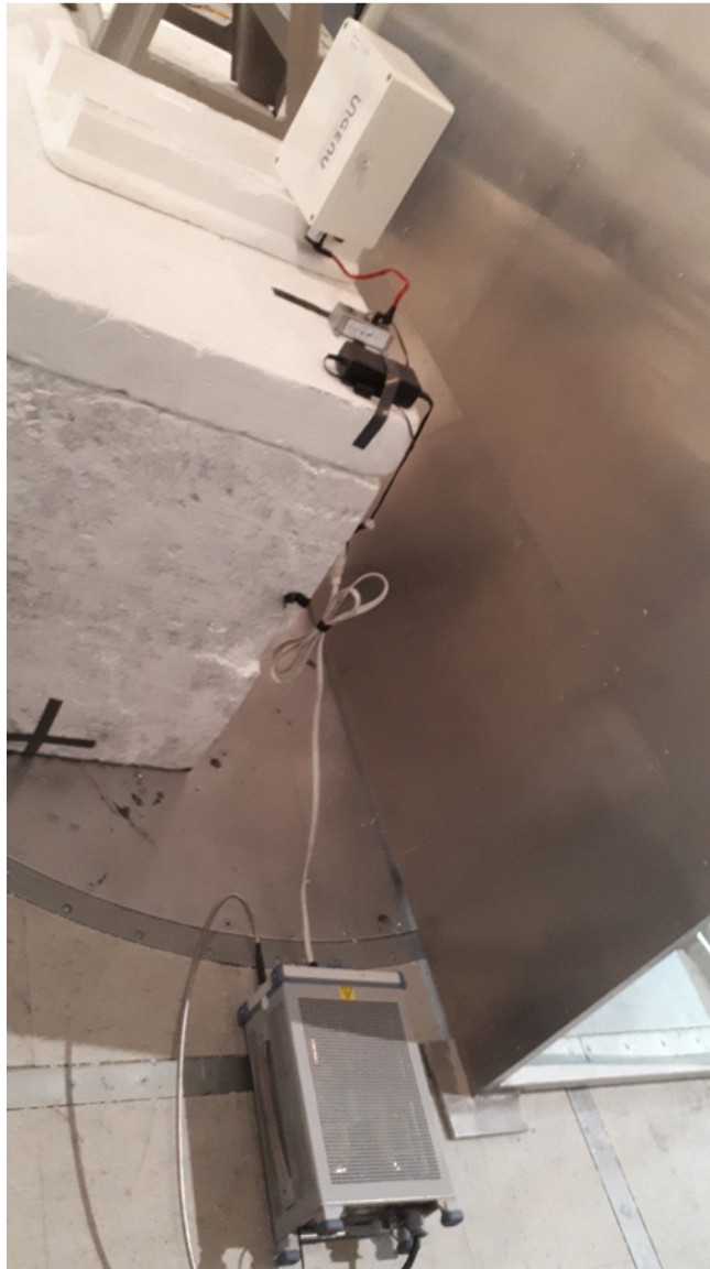
Conducted emissions setup photo