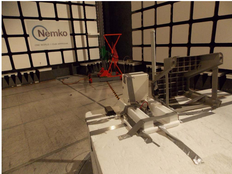
Radiated spurious (out-of-band) emissions setup photo – 30 to 1000 MHz