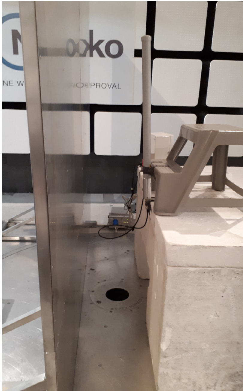
Conducted emissions setup photo