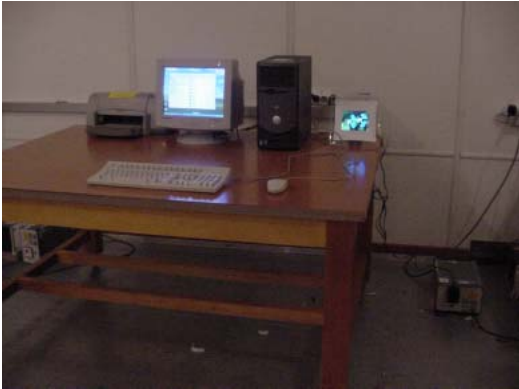
< FORNT PHOTOGRAPH OF CONTINUOUS DISTURBANCE VOLTAGE >