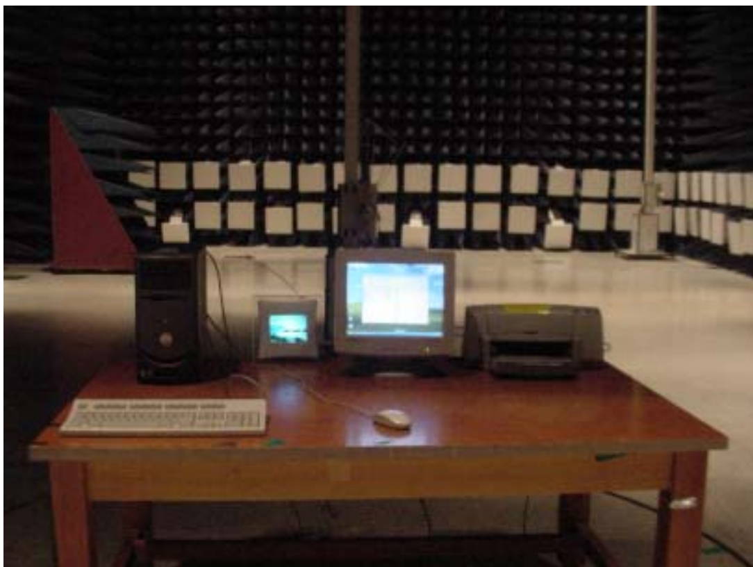
< FRONT PHOTOGRAPH OF RADIATED DISTURBANCE >