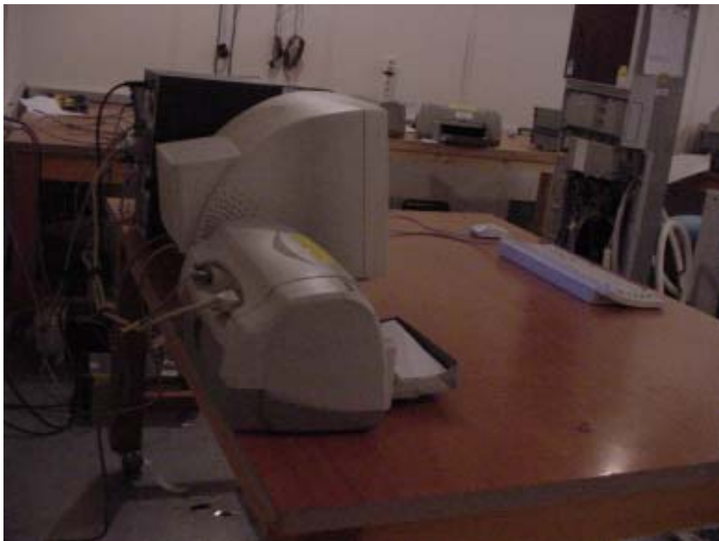
< REAR PHOTOGRAPH OF CONTINUOUS DISTURBANCE VOLTAGE >