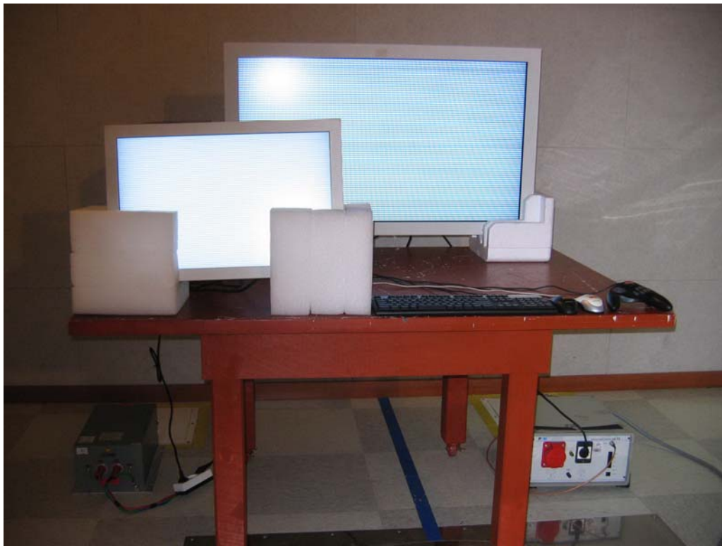
Figure 1 Conducted Emission Test Setup: DVI Mode