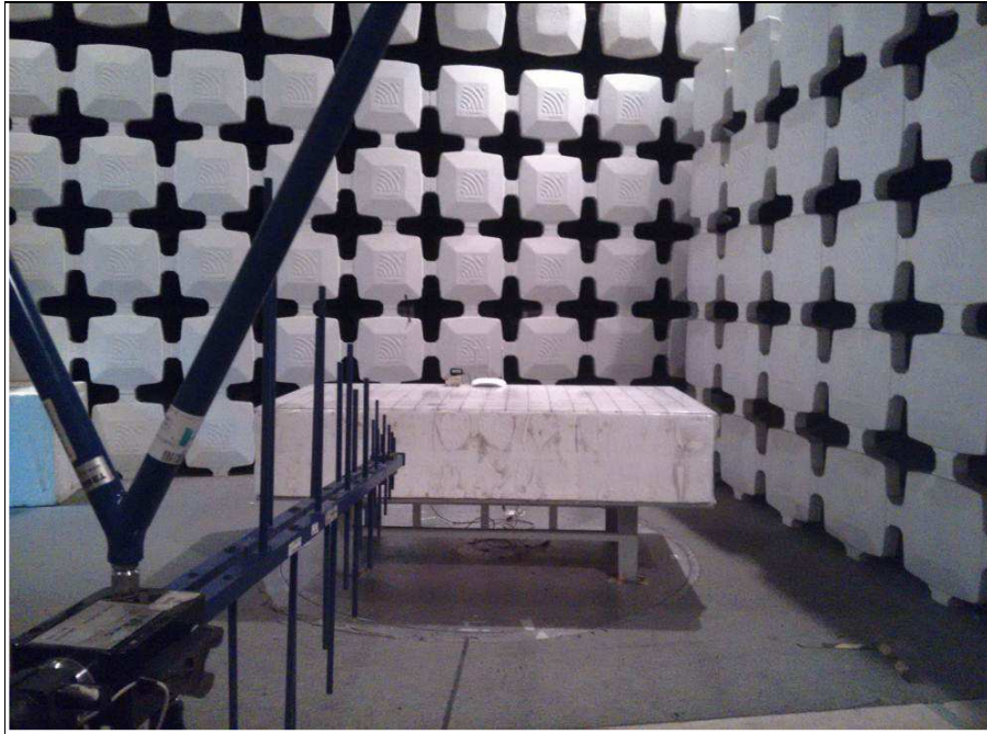
Frequency Range < Above 1GHz >