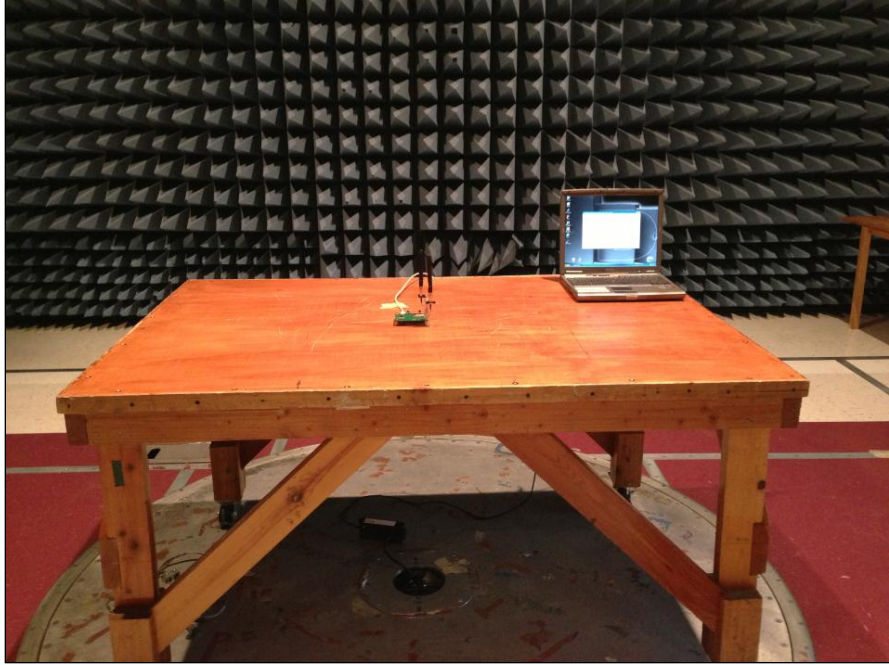
Photograph 3. Radiated Emissions, Test Setup