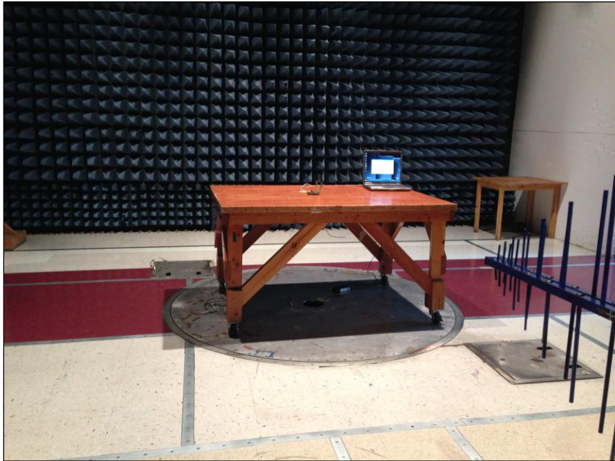
Photograph 4. Radiated Emissions, Test Setup, 30 MHz – 1 GHz