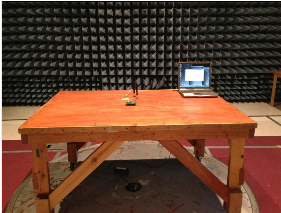
Photograph 8. Radiated Spurious Emissions, Test Setup