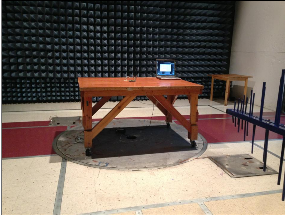
Photograph 9. Radiated Spurious Emissions, Test Setup 30MHz – 1GHz