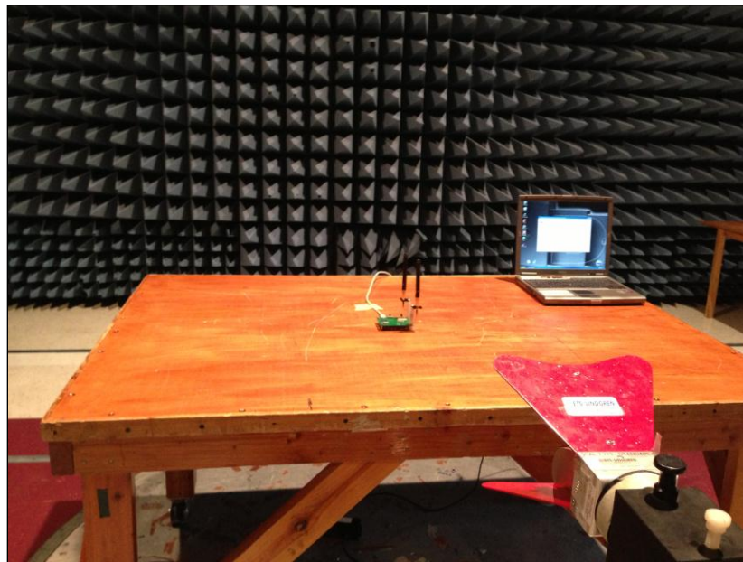
Photograph 10. Radiated Spurious Emissions, Test Setup above 1 GHz (1 Meter Distance for Radiated Spurious)