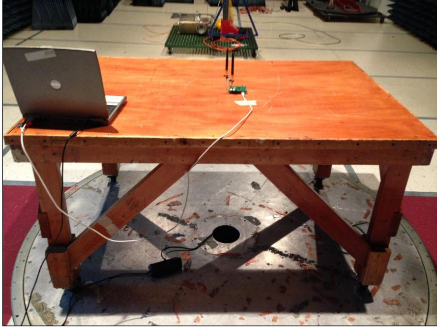
Photograph 5. Radiated Emissions, Test Setup, Rear View