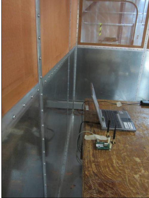
Photograph 7. Conducted Emissions, 15.207(a), Test Setup, Side View