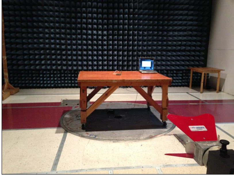
Photograph 11. Radiated Spurious Emissions, Test Setup above 1 GHz (3 Meter Distance for Radiated Band Edge)