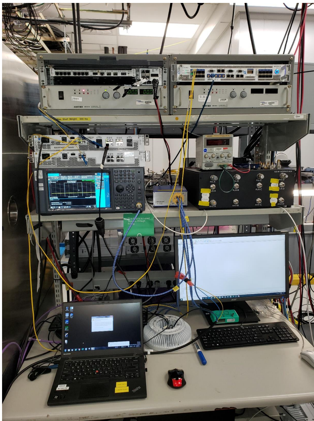
Figure 2: Conducted test setup