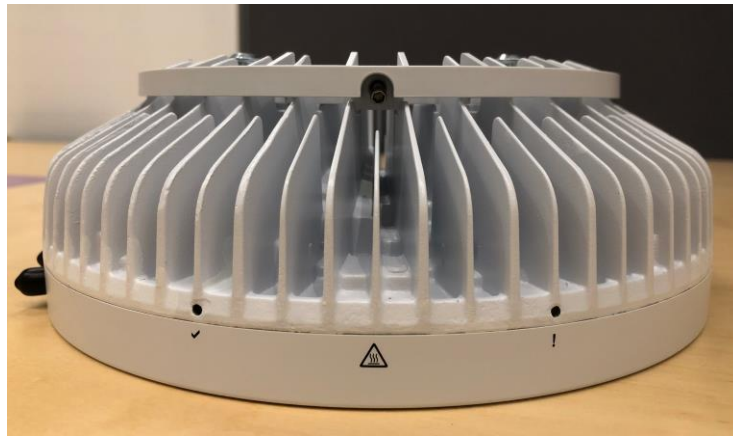
Figure 3: Dot 4469 B77D Side View