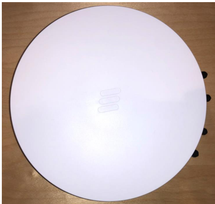
Figure 1: Dot 4469 B77D Top (Radome) View