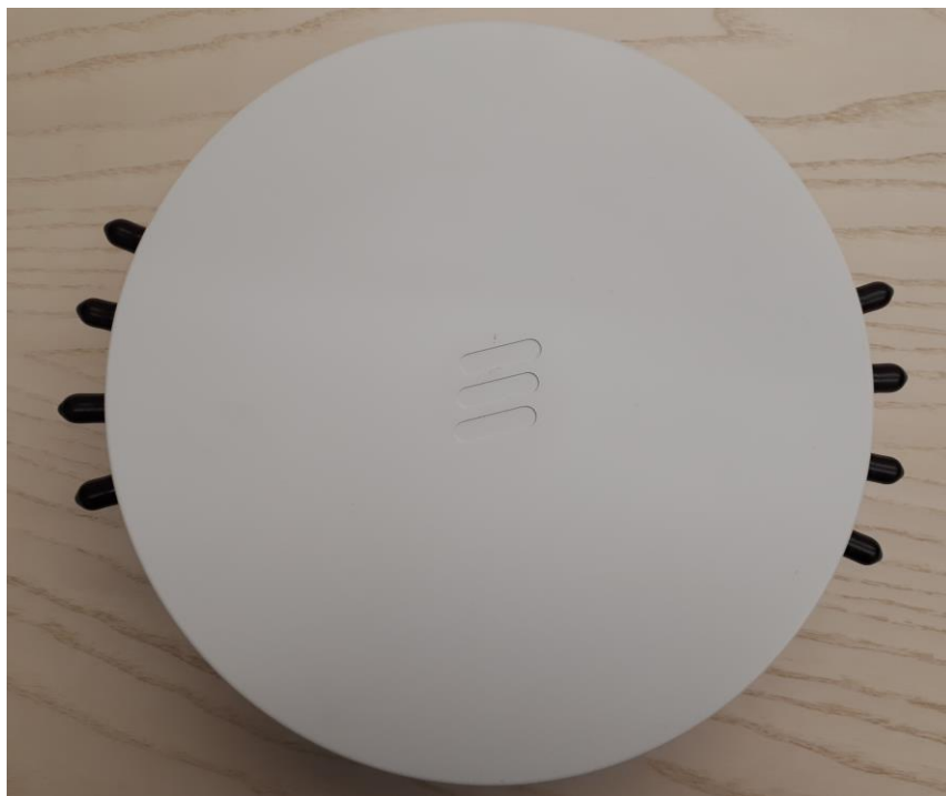
Figure 1: Dot 2284 B25B66 Top (Radome) View