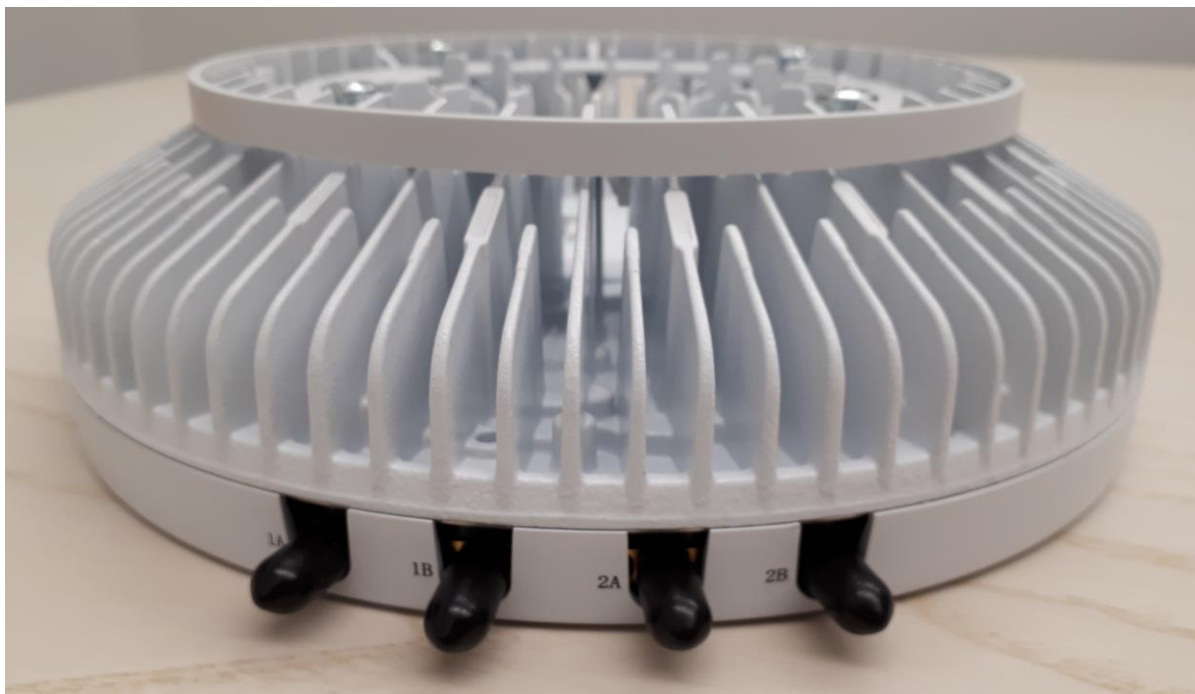
Figure 3: Dot 2284 B25B66 Side View