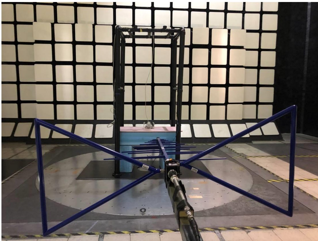
Figure 1: Radiated Test setup (30 to 1000MHz)