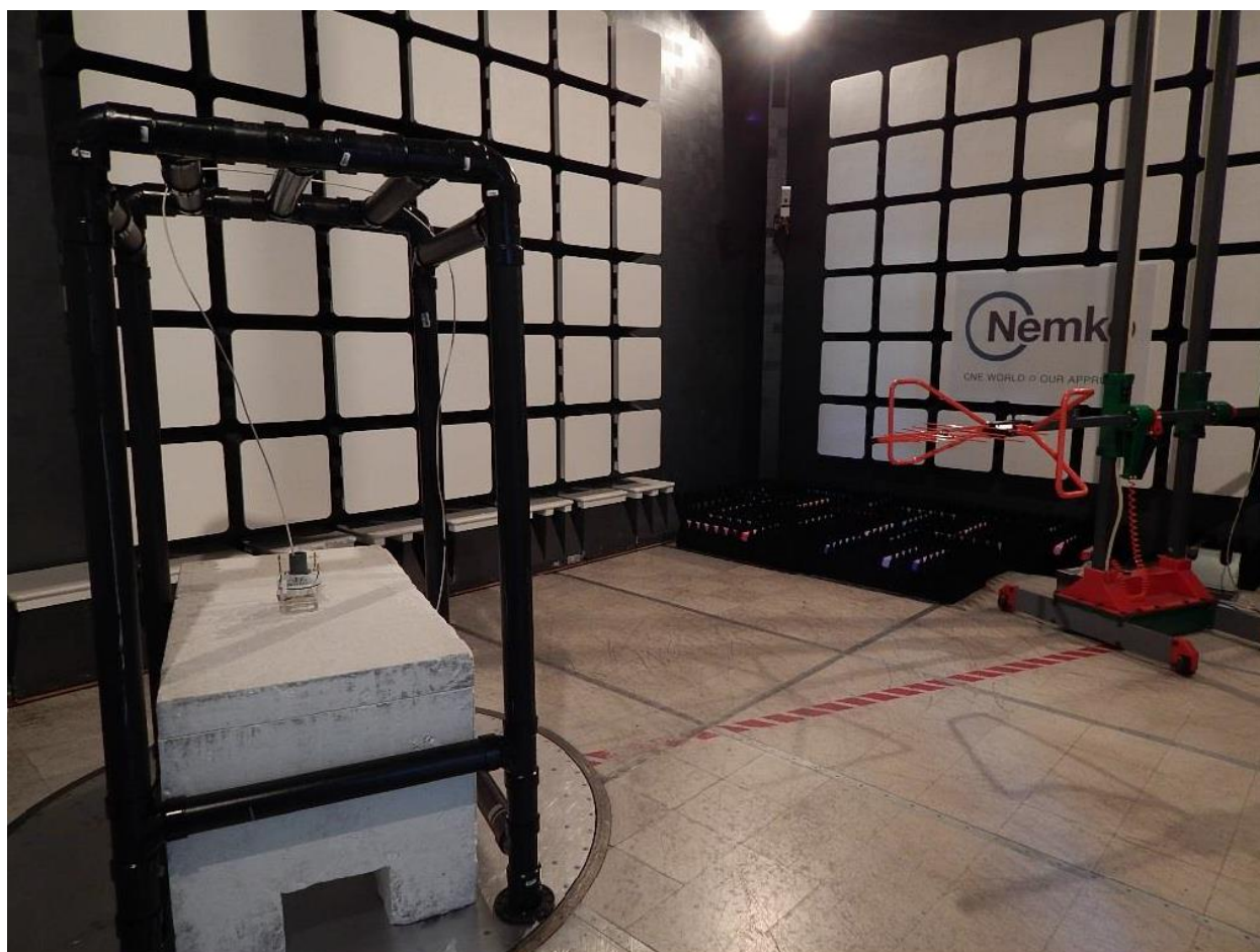
Figure 1: Radiated Test setup (30 to 1000MHz)