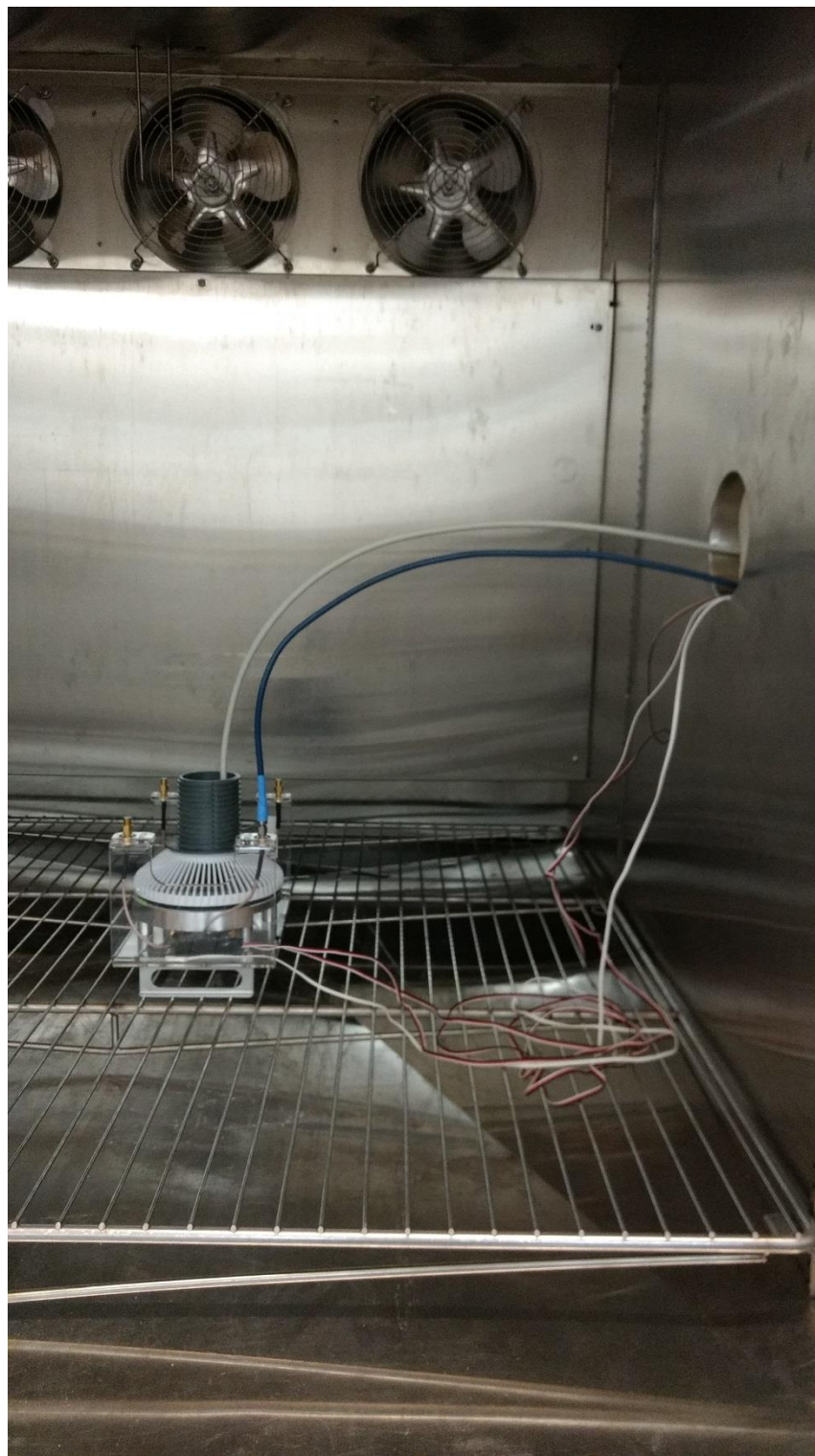
Figure 4: EUT test fixture in a thermal test chamber