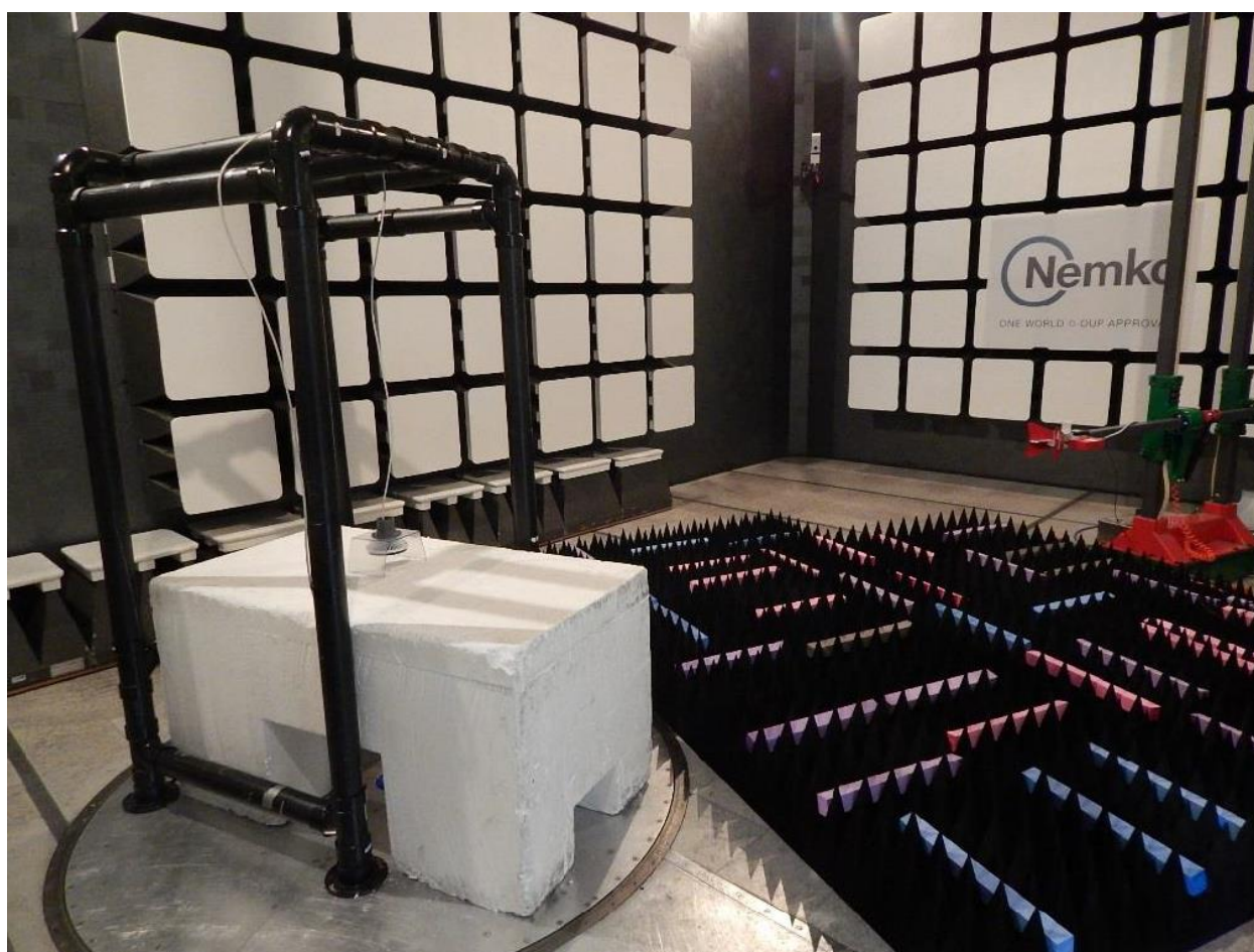
Figure 2: Radiated Test setup (frequency 1 – 18 GHz)