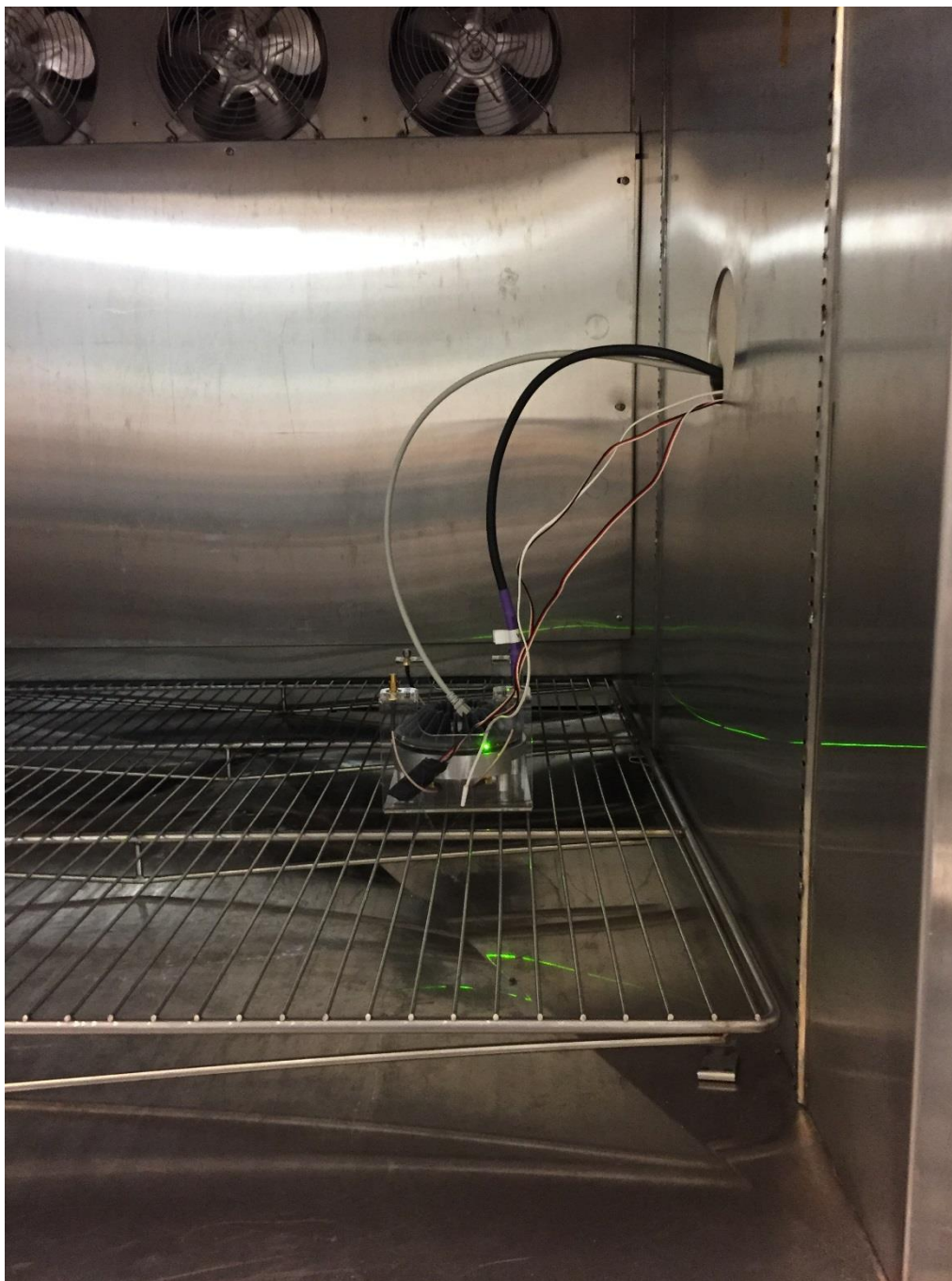
Figure 5: EUT test fixture in a thermal test chamber