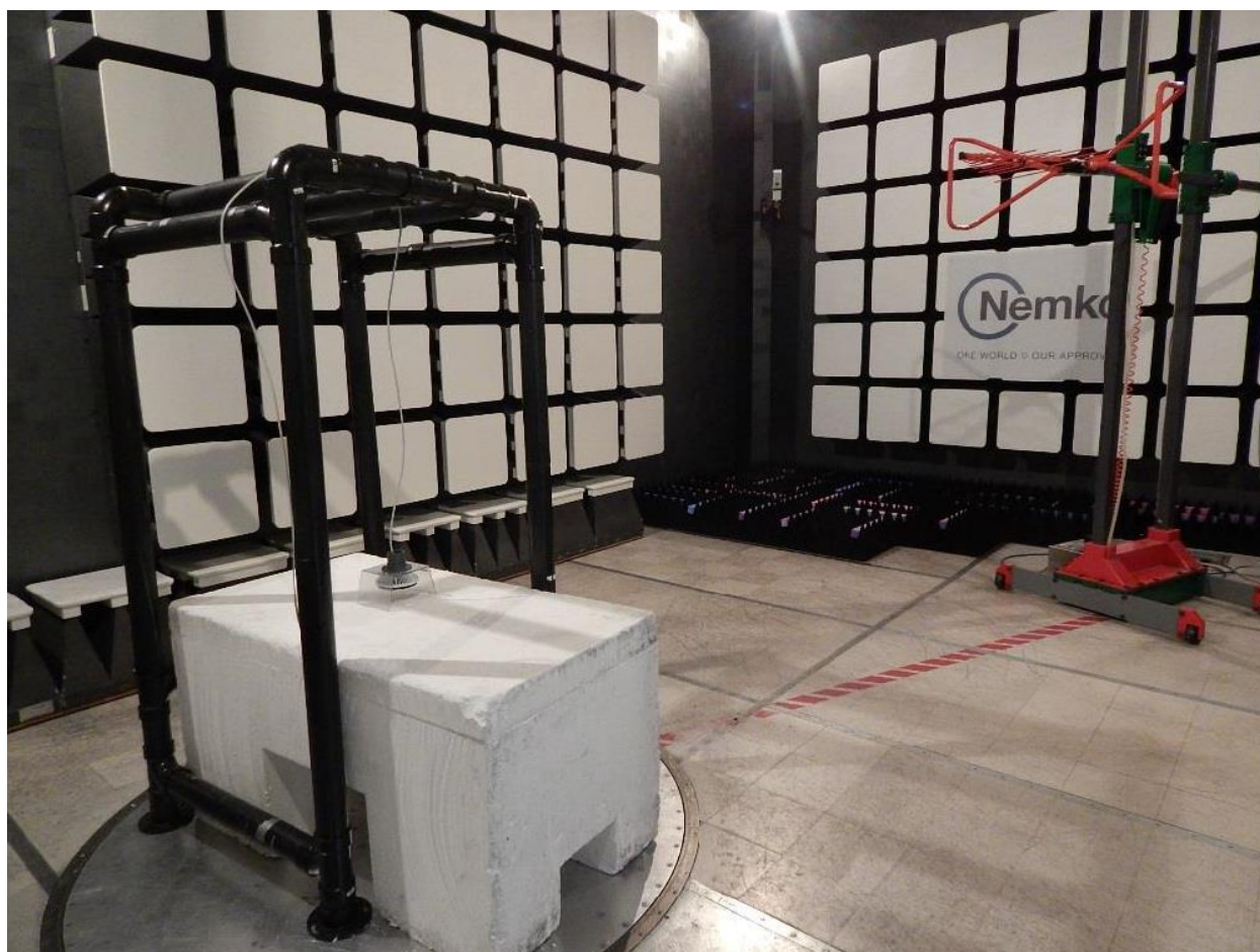
Figure 1: Radiated Test setup (30 to 1000MHz)