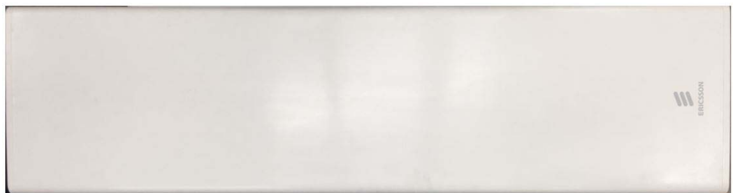
Figure 4: AIR 3246 B2 B25 Front View