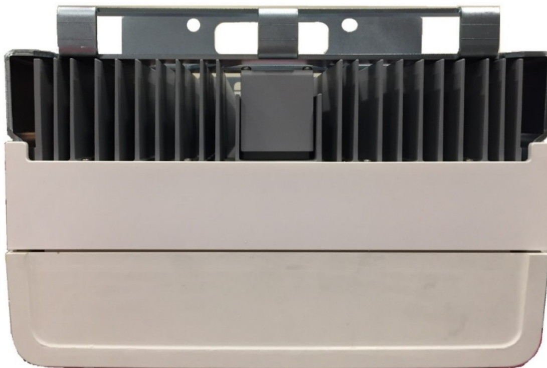
Figure 1: AIR 3246 B2 B25 Top View