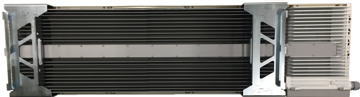
Figure 3: AIR 3246 B2 B25 Back View